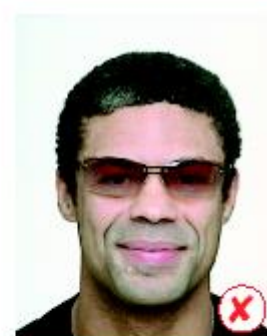
Dark tinted glasses