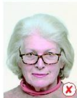
Frames covering eyes