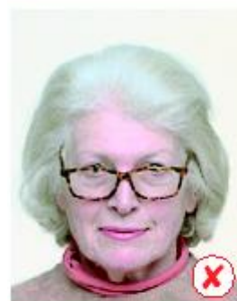
Frames covering eyes