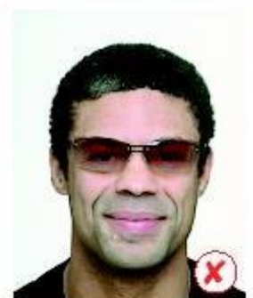
Dark tinted glasses