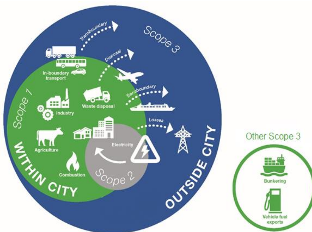
Figure 2: GHG Inventory sources and scopes

Gibraltar has four iterations of the city-scale GHG inventory: 2013, 2015, 2016 and 2017. The inventory will continue to be annually updated and reported to CDP 3 to fulfil the requirements of the GCoM.