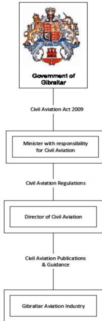
Figure 2 – Gibraltar civil aviation framework

7.4.4. The Gibraltar civil aviation framework is shown at Figure 2.