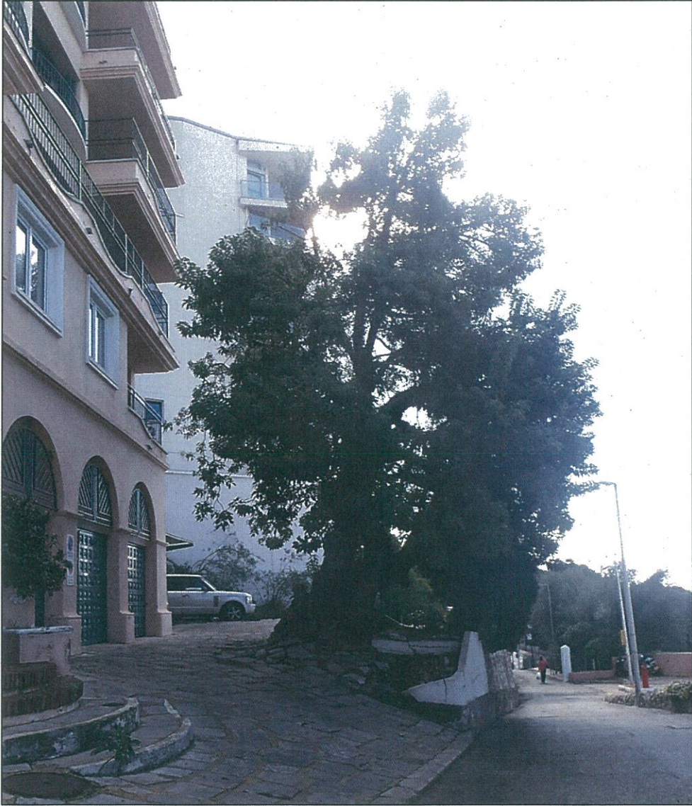
23 Gardiner's Road, Gardiner's House