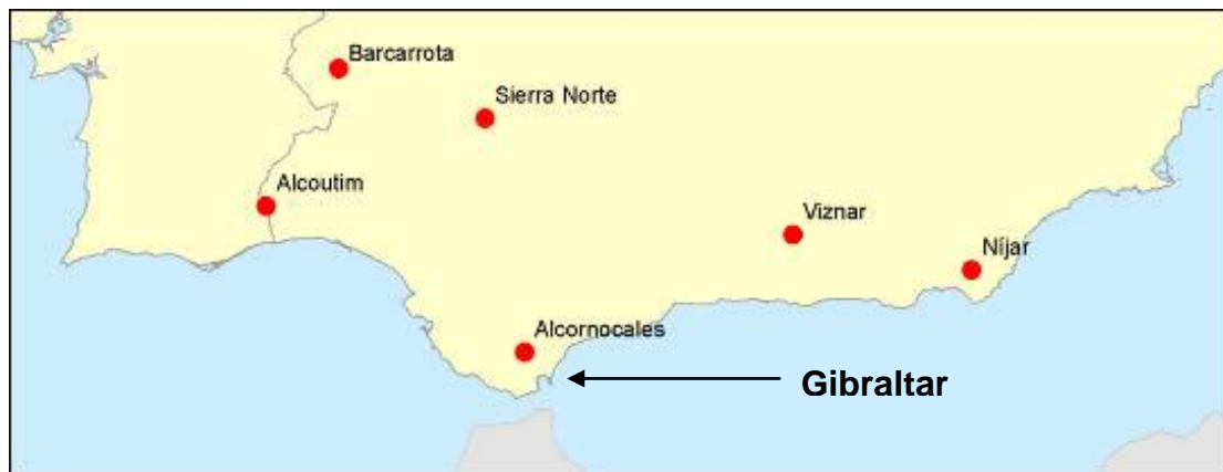
Figure 1 Spanish regional background sites used in analysis