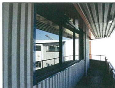
Views from walkway