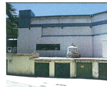
Views from Rosia Road