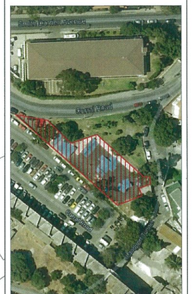
Location Plan NTS

NOTES: ALL DIMENSIONS MUST BE CHECKED ON SITE AND NOT SCALED FROM THIS DRAWING.