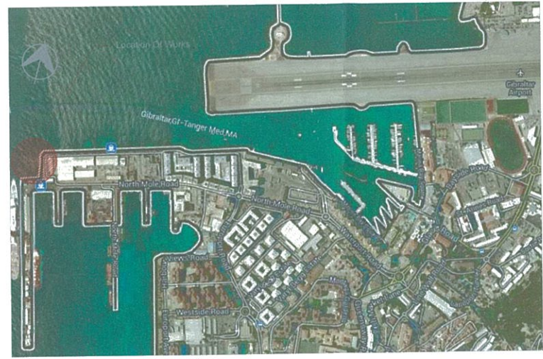
SITE PLAN Scale: NTS