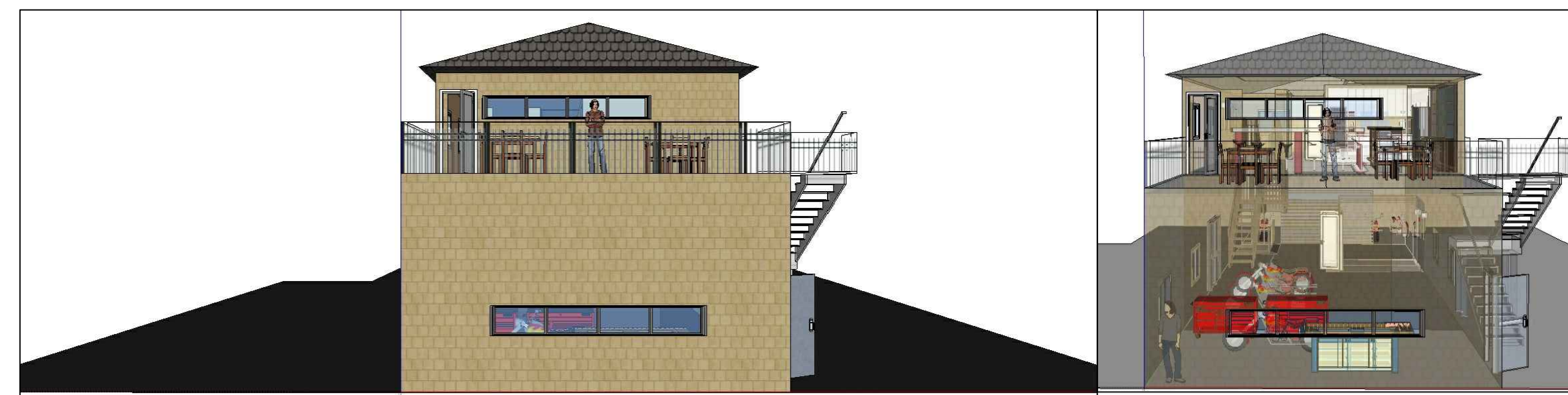
SECTION C-C ELEVATION