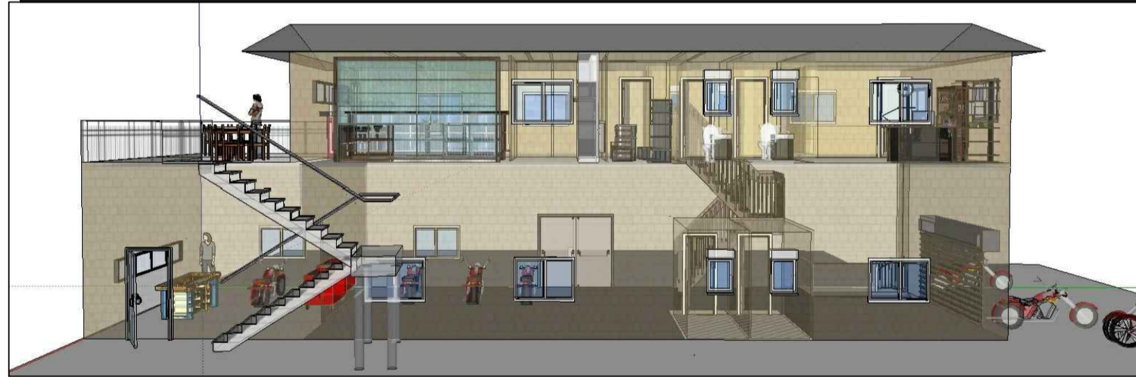
SECTION B-B ELEVATION