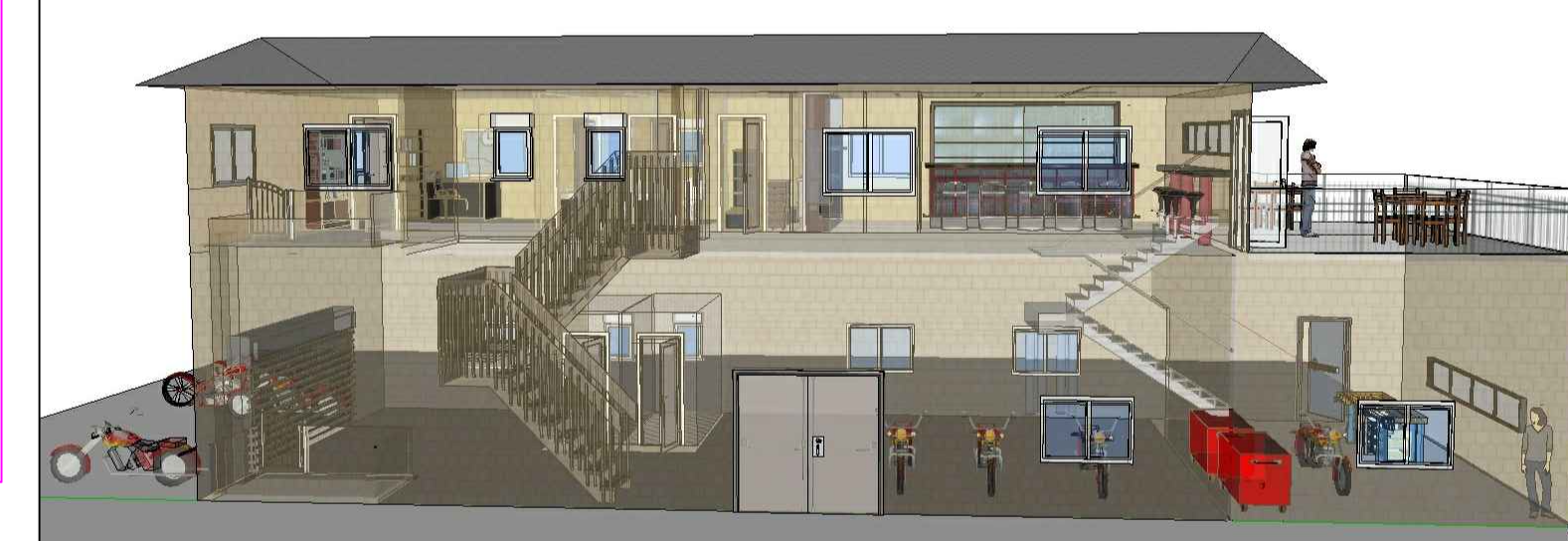
SECTION A-A ELEVATION