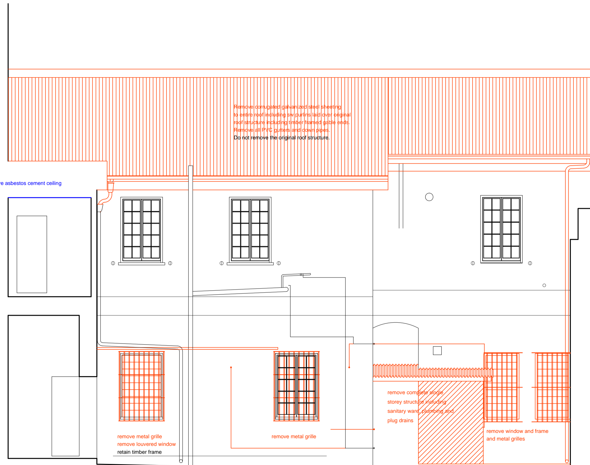
Section F - F (South Elevation to rear yard)