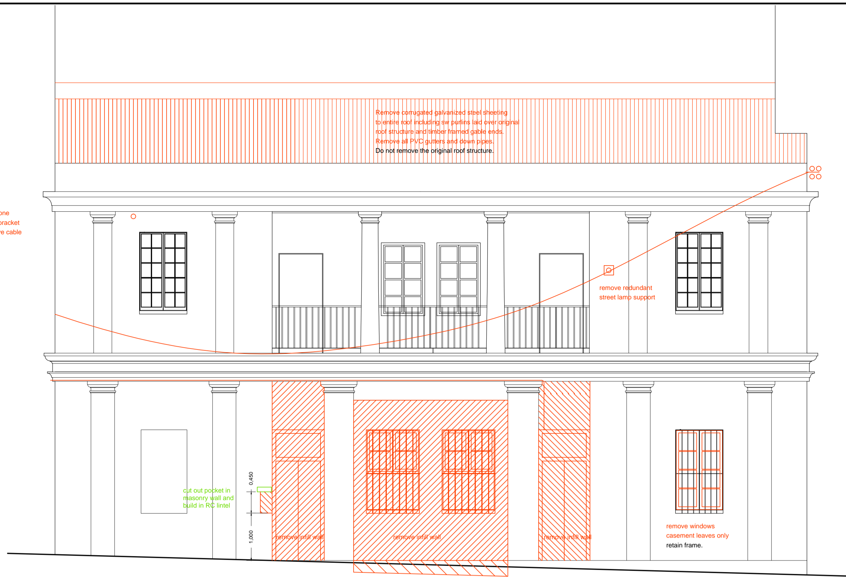
North Elevation (to John Mackintosh Square)