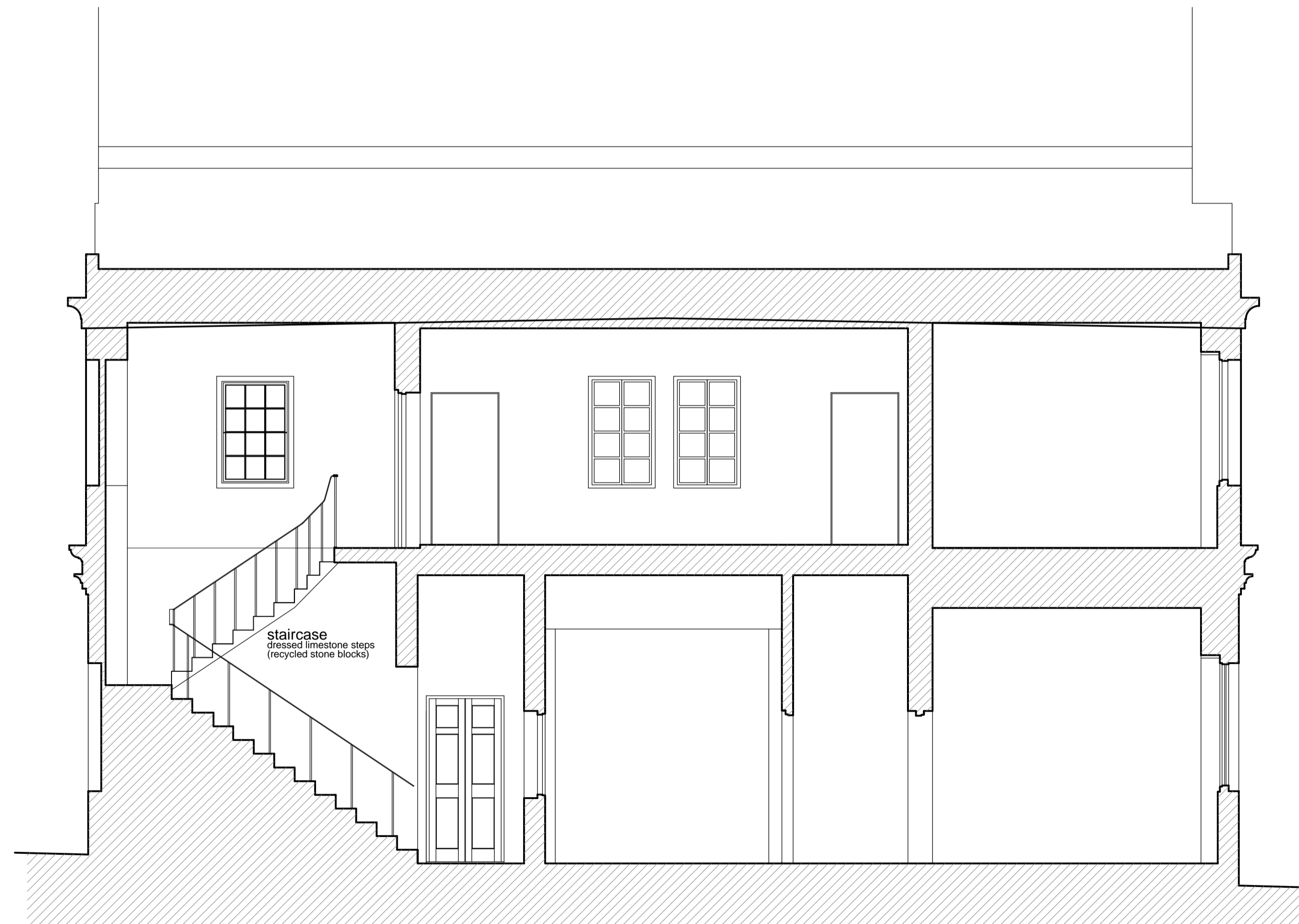
SECTION D - D