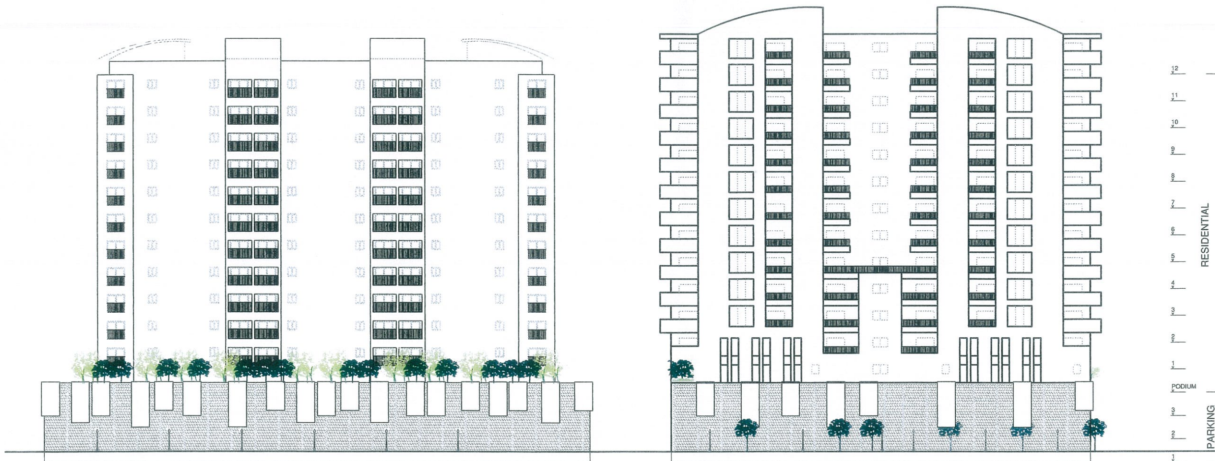
Scheme 2 South Elevation

notes This drawing is the copyright and property of AKS Architects and Engineers Ltd. It must not be copied or published without written consent. Do not scale from this drawing. All dimensions to be checked on site.