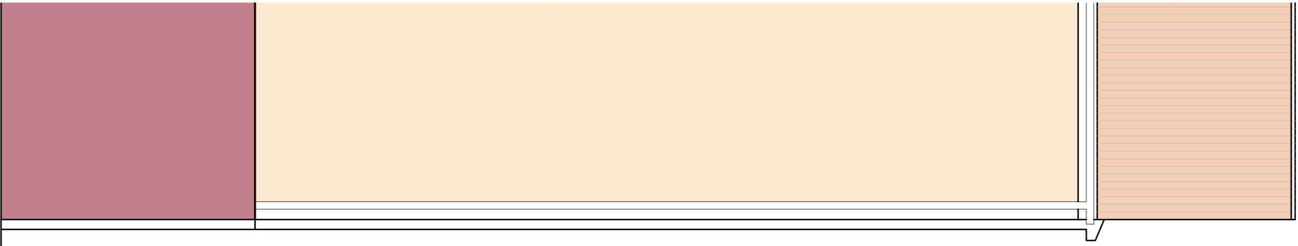
Proposed Partial East Elevation