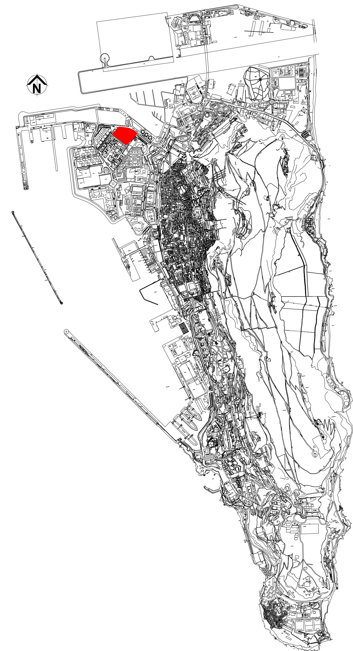
LOCATION MAP Scale 1/15000

NOTES: DO NOT SCALE OFF THIS DRAWING. CHECK DIMENSIONS ON SITE PRIOR TO COMMENCEMENT. THIS DRAWING IS THE COPYRIGHT OF WSRM ARCHITECTS LTD. AND MUST NOT BE COPIED OR REPRODUCED, IN PART OR IN WHOLE, WITHOUT PERMISSION OF WSRM ARCHITECTS LTD. TO BE READ IN CONJUNCTION WITH OTHER RELEVANT CONSULTANTS INFORMATION.