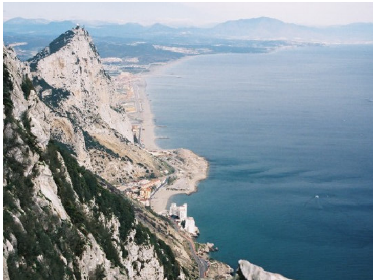
Photograph 35: View of eastern shoreline from Rock ridge.