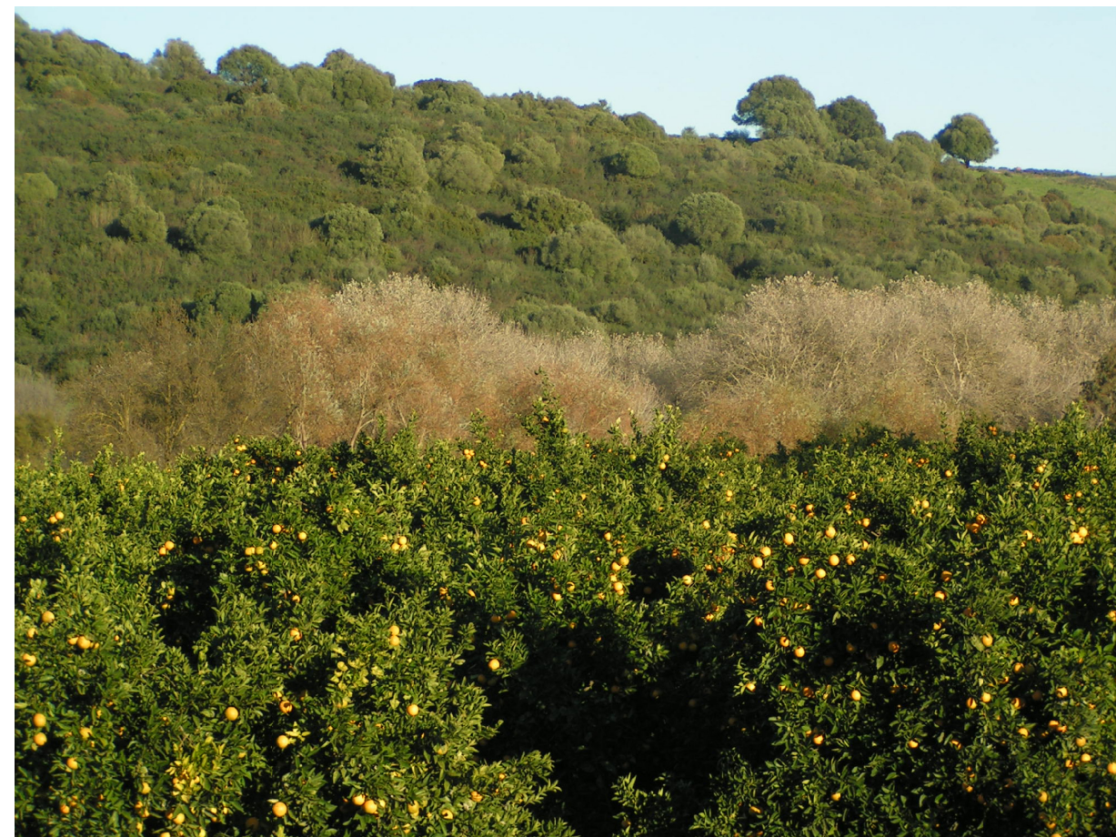
Photograph 36: Rolling upland farmland and broad valley rolling lowland behind Spanish coastline north of Gibraltar.