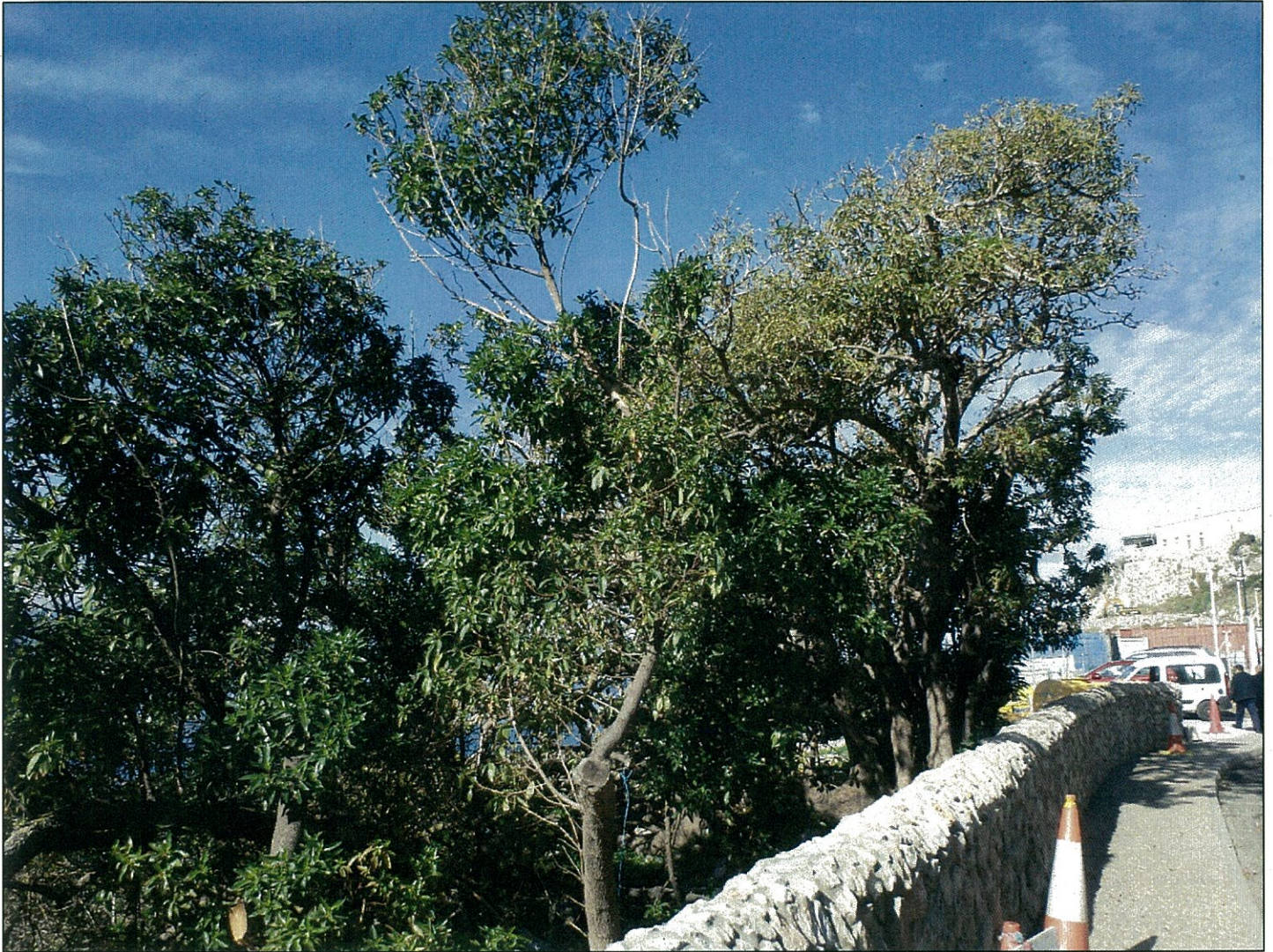
Europa Pass (West) Europa Road – T.1