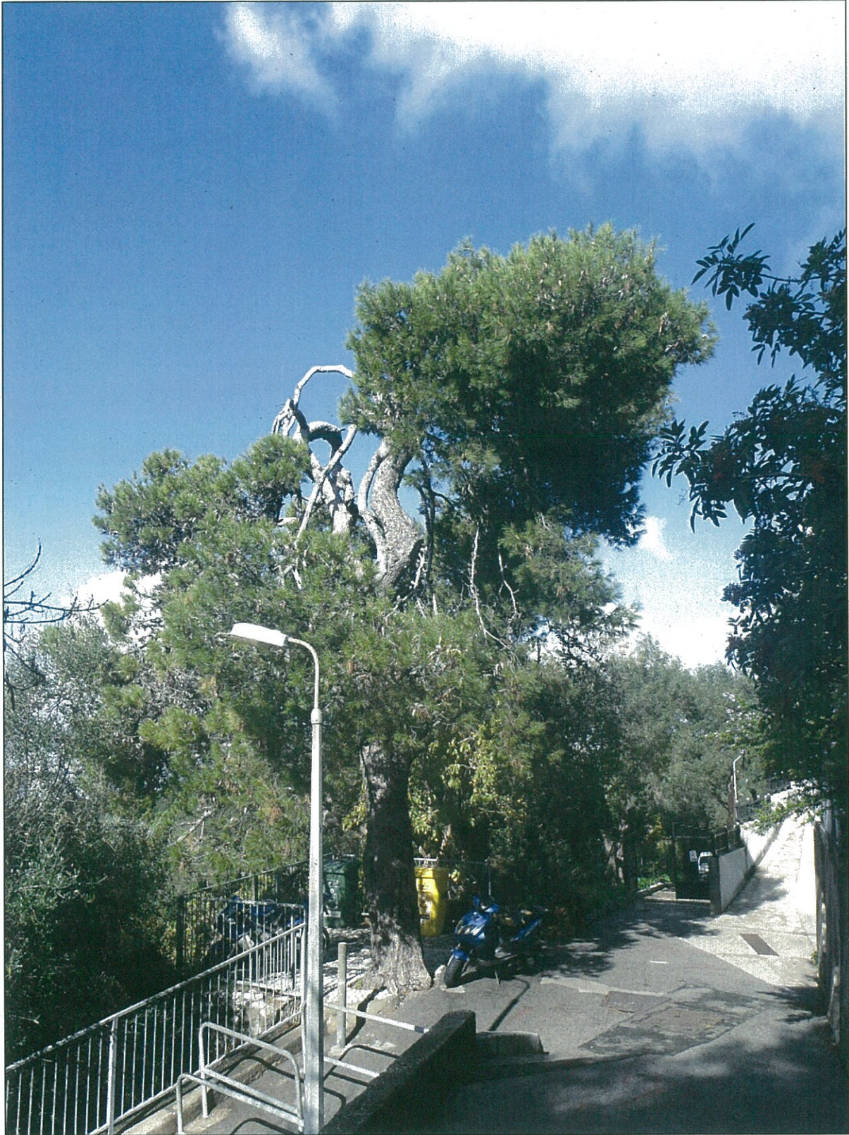
Alameda Upper Walk, Europa Road (Opp. Old Casino) – T.1