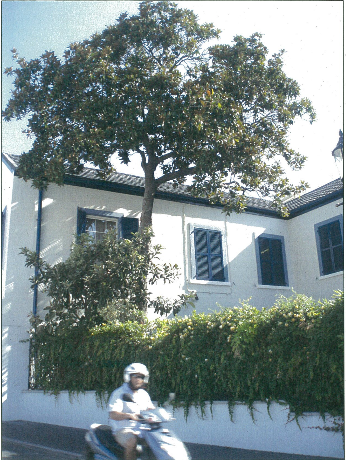
Joshua Hassan House, Secretary's Lane – T.1