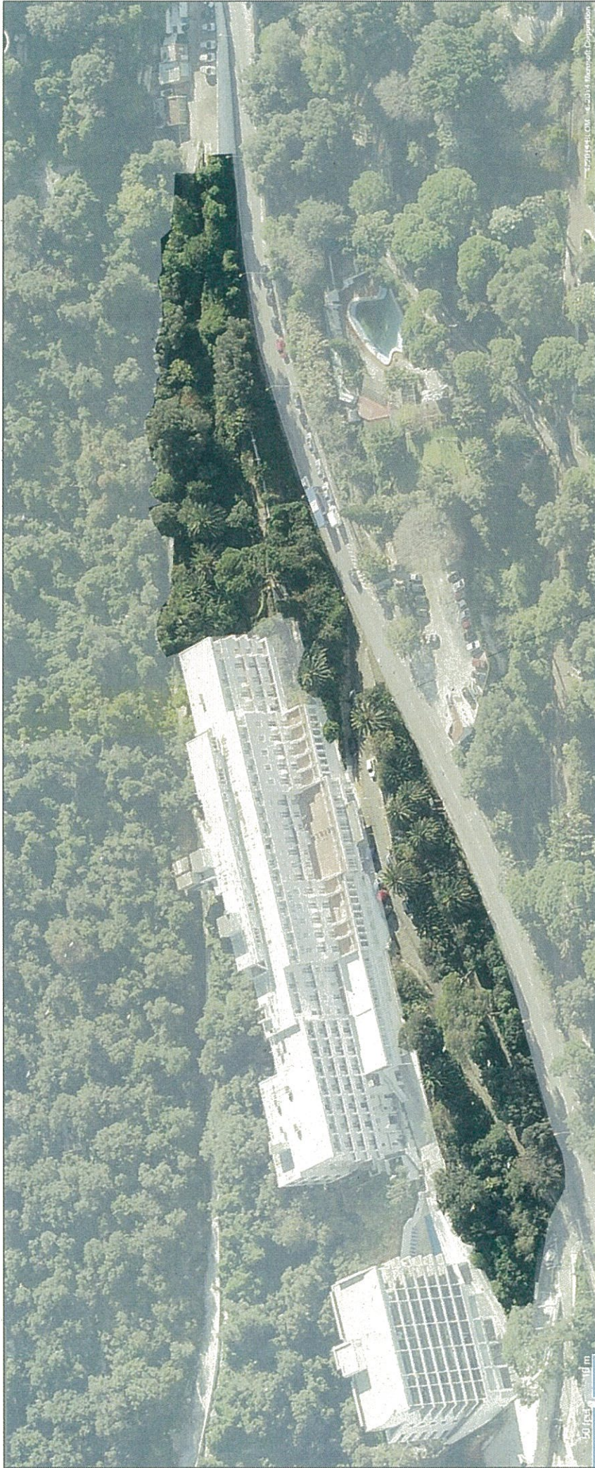
The Rock Hotel Gardens, Europa Road – W.1