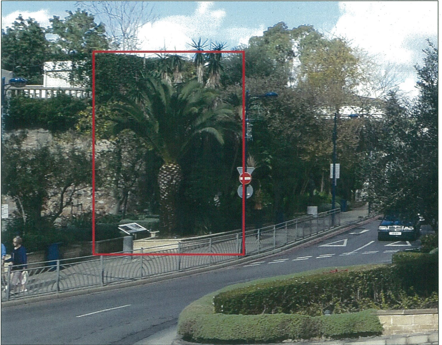
Referendum Gates (Trafalgar Interchange) – T.2