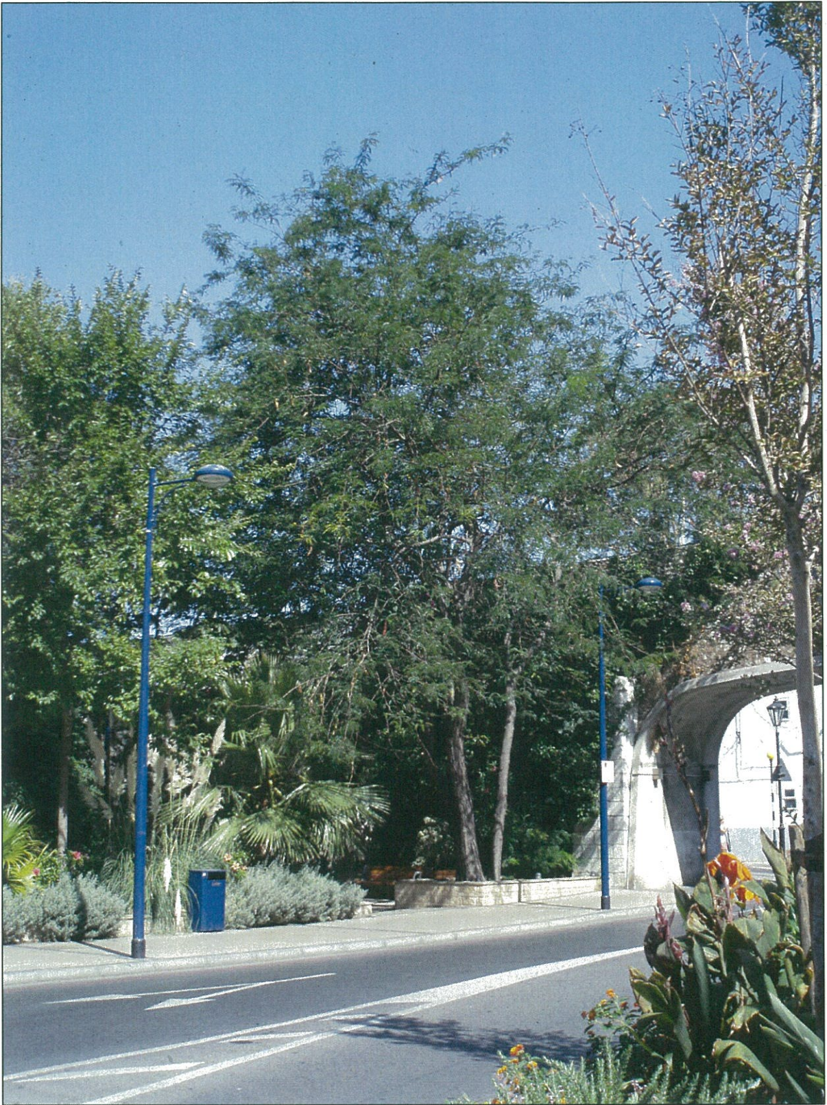
Referendum Gates (Trafalgar Interchange) – T.1