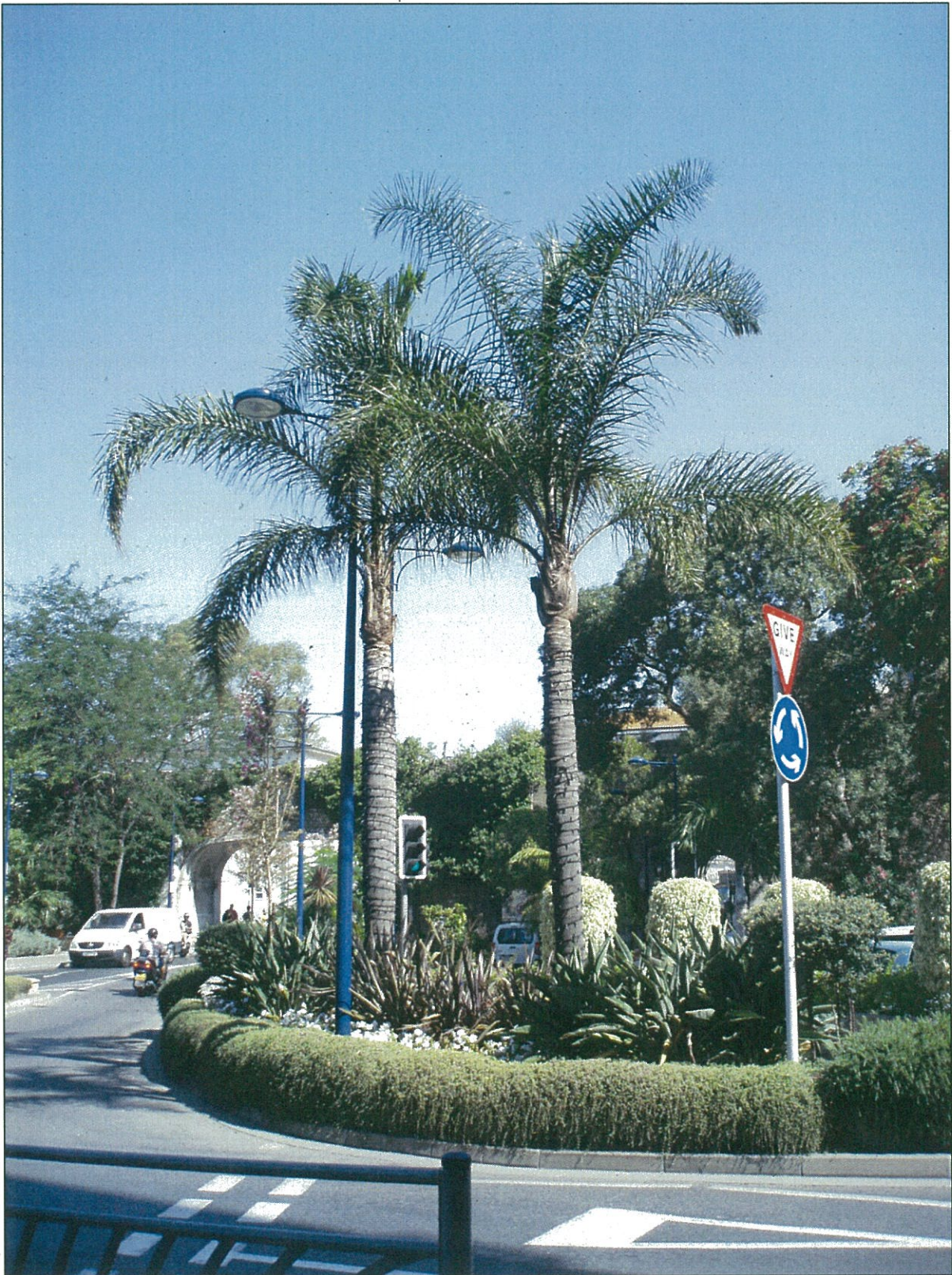
Referendum Gates (Trafalgar Interchange) – T.3