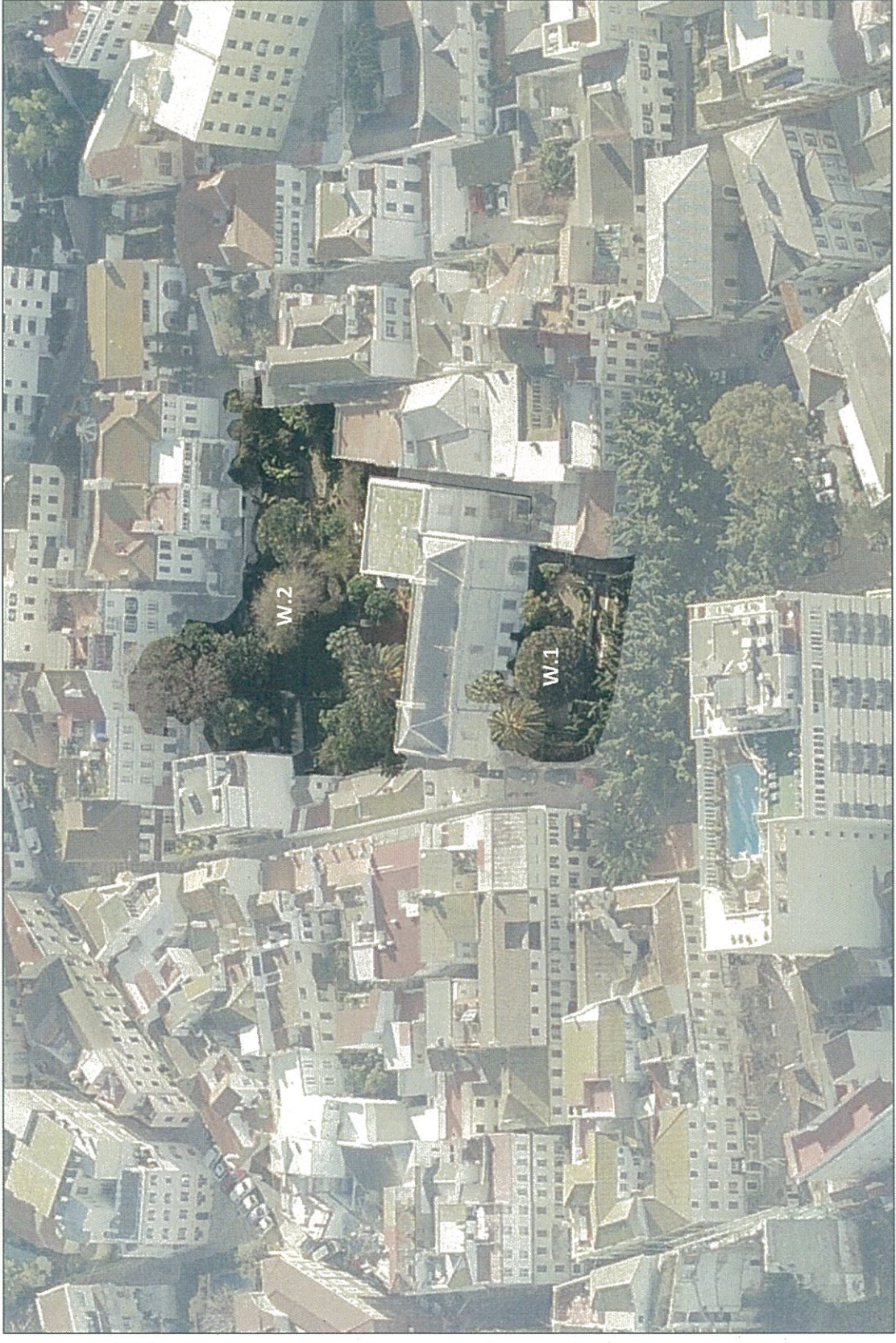
Garrison Library Gardens – W.1 & W.2