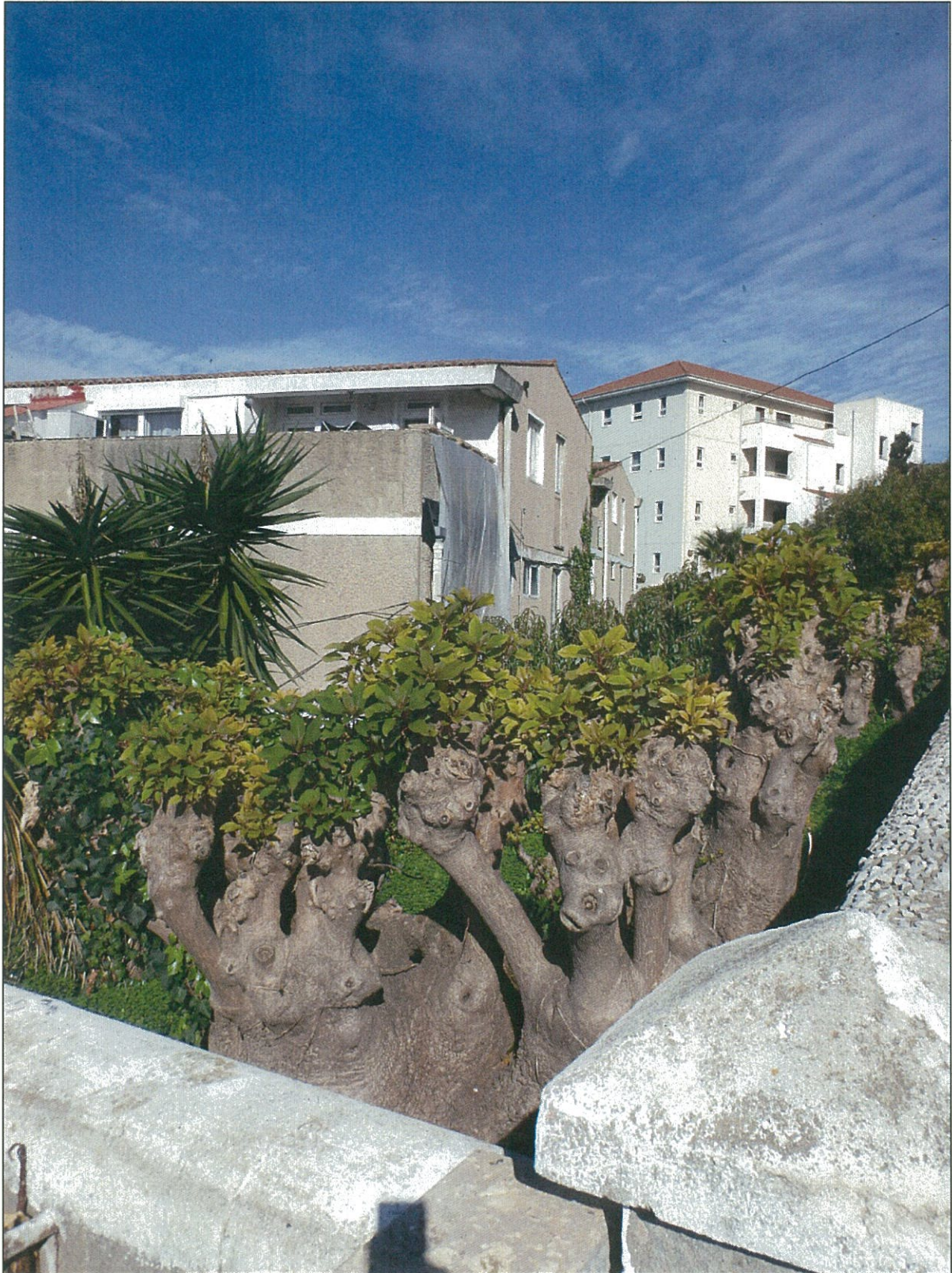
Elliot's Battery Estate, Europa Point – T.2