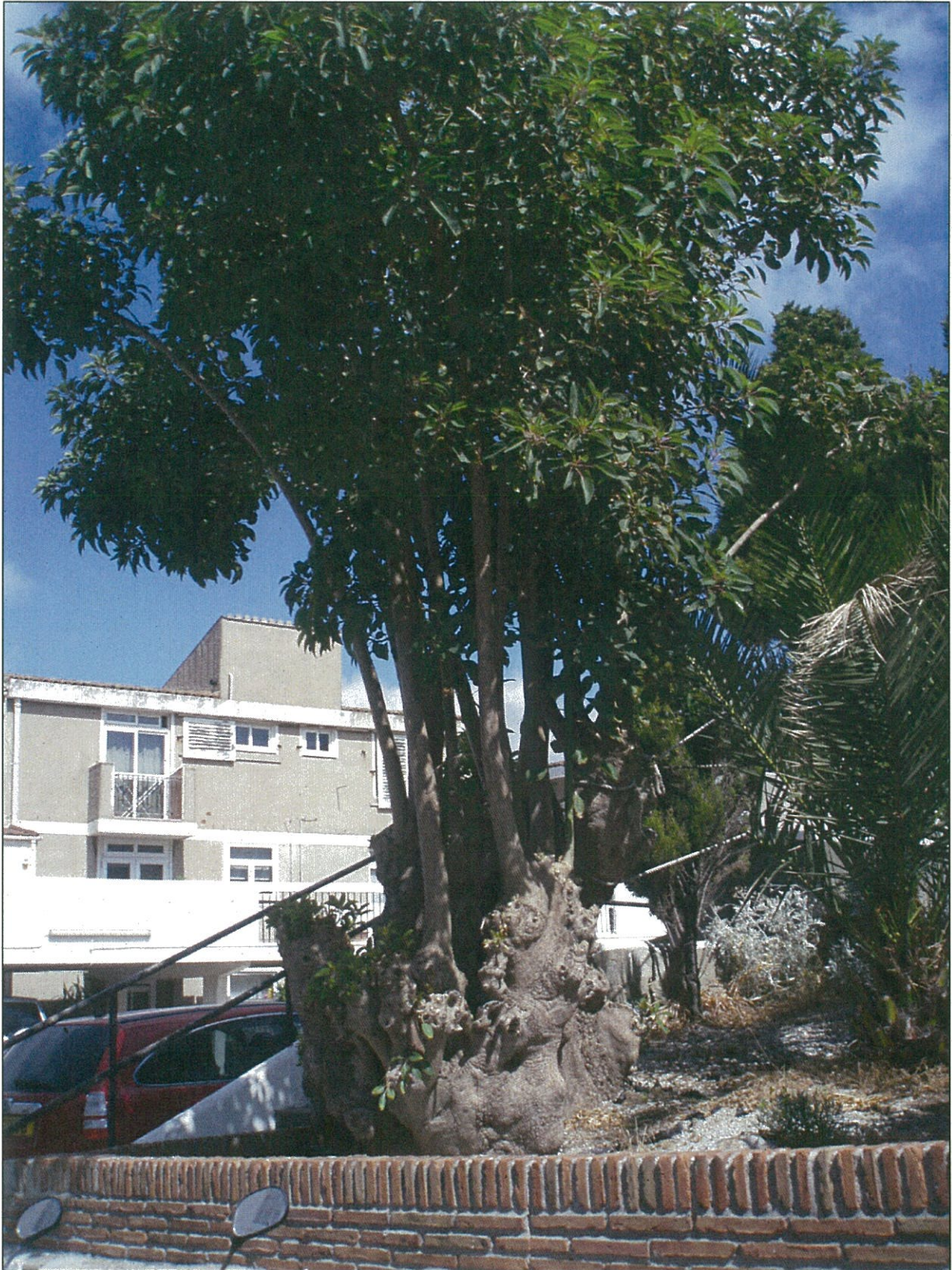
Elliot's Battery Estate, Europa Point – T.7