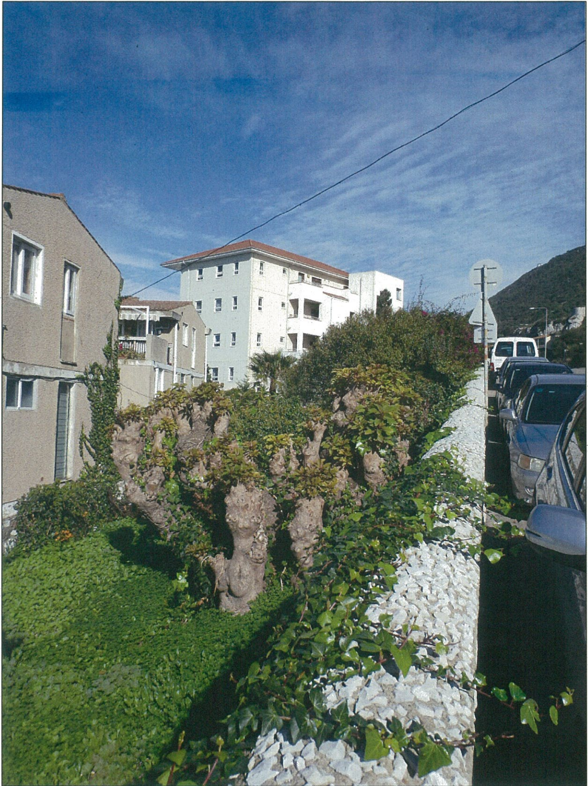
Elliot's Battery Estate, Europa Point – T.1