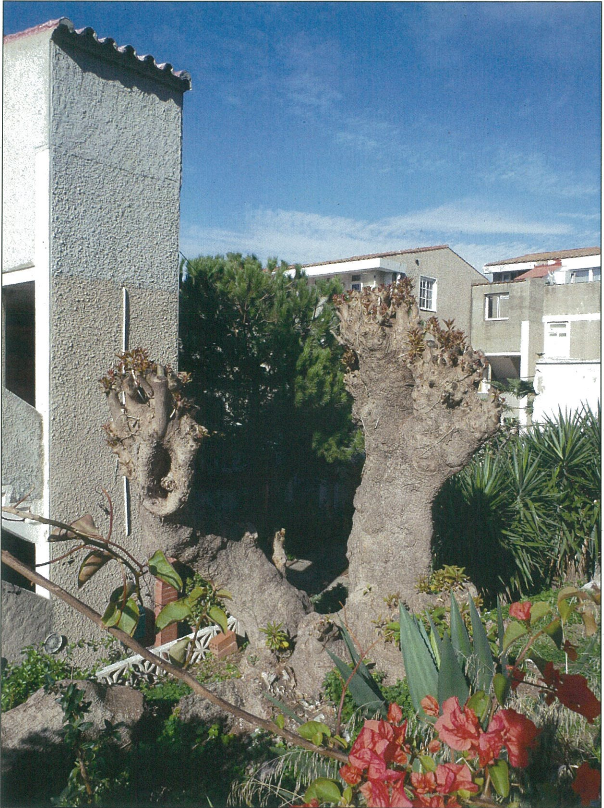
Elliot's Battery Estate, Europa Point – T.4