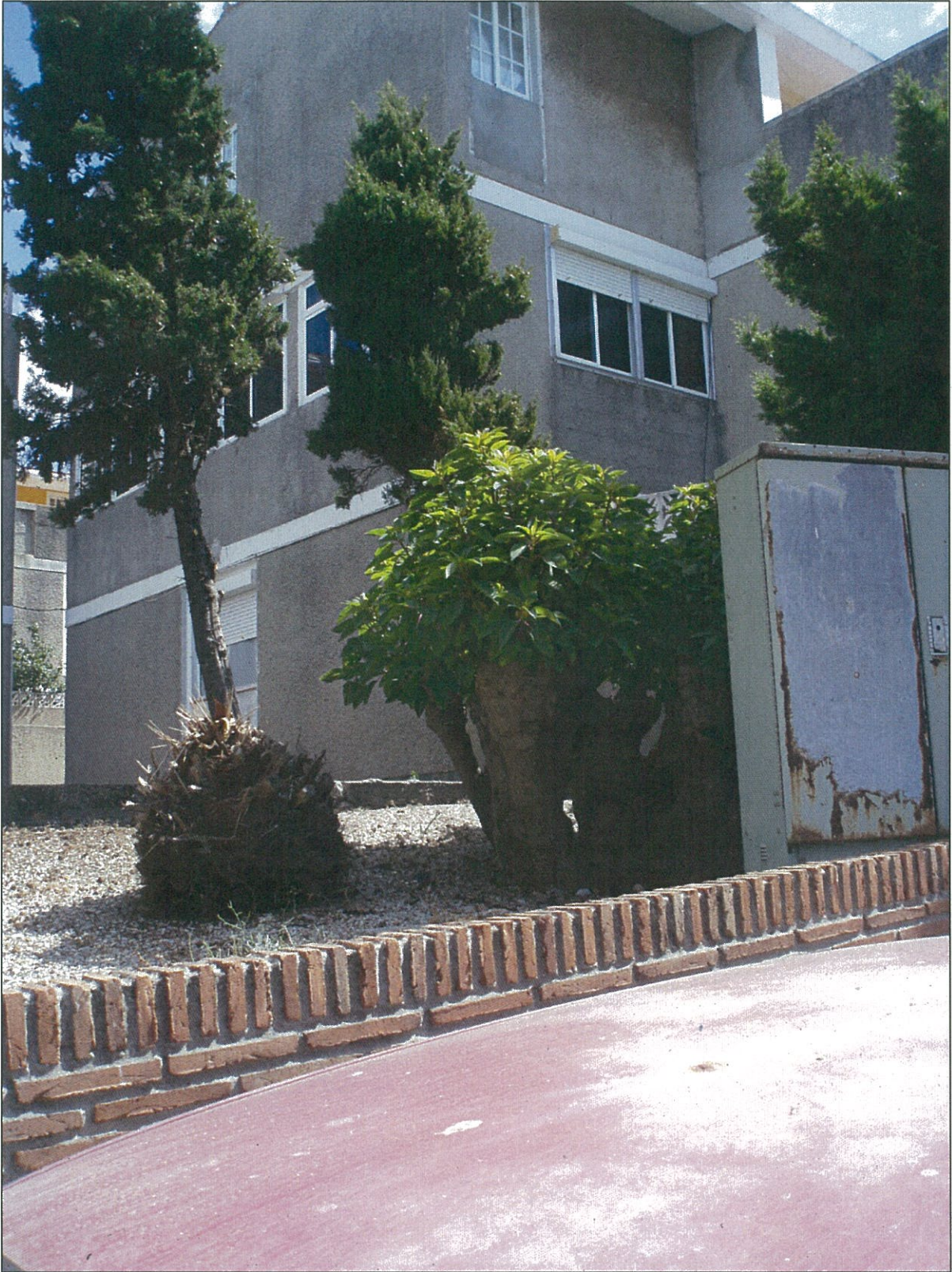
Elliot's Battery Estate, Europa Point – T.6