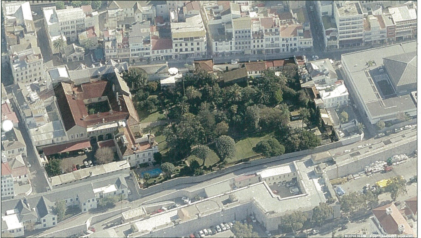
The Convent Gardens, Convent Place – W.1