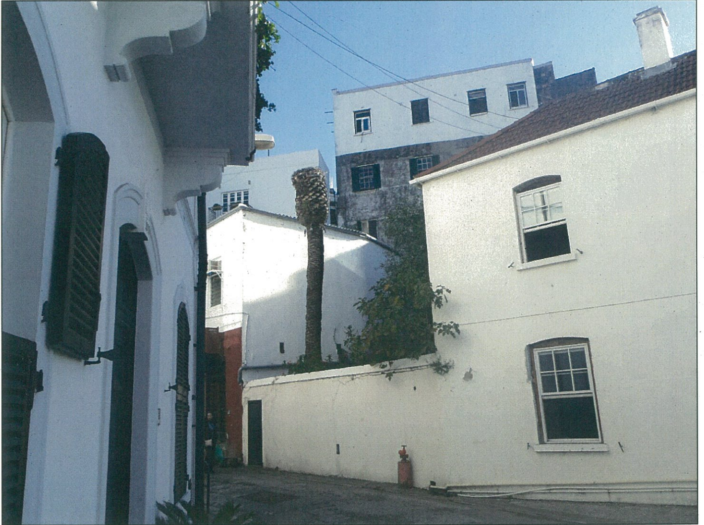
The Deanery, Bomb House Lane – T.1