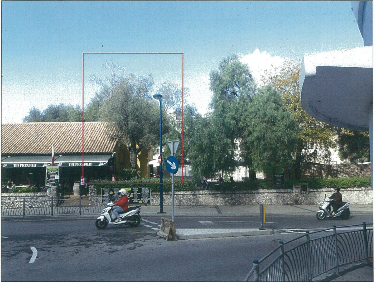
Piccadilly Gardens, Rosia Road – T.1