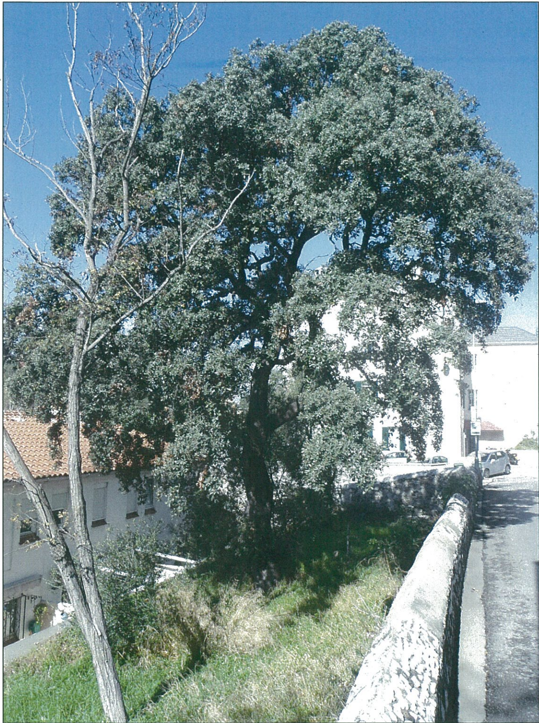
Former M.O.D. Quarters, South Barrack Road – T.1