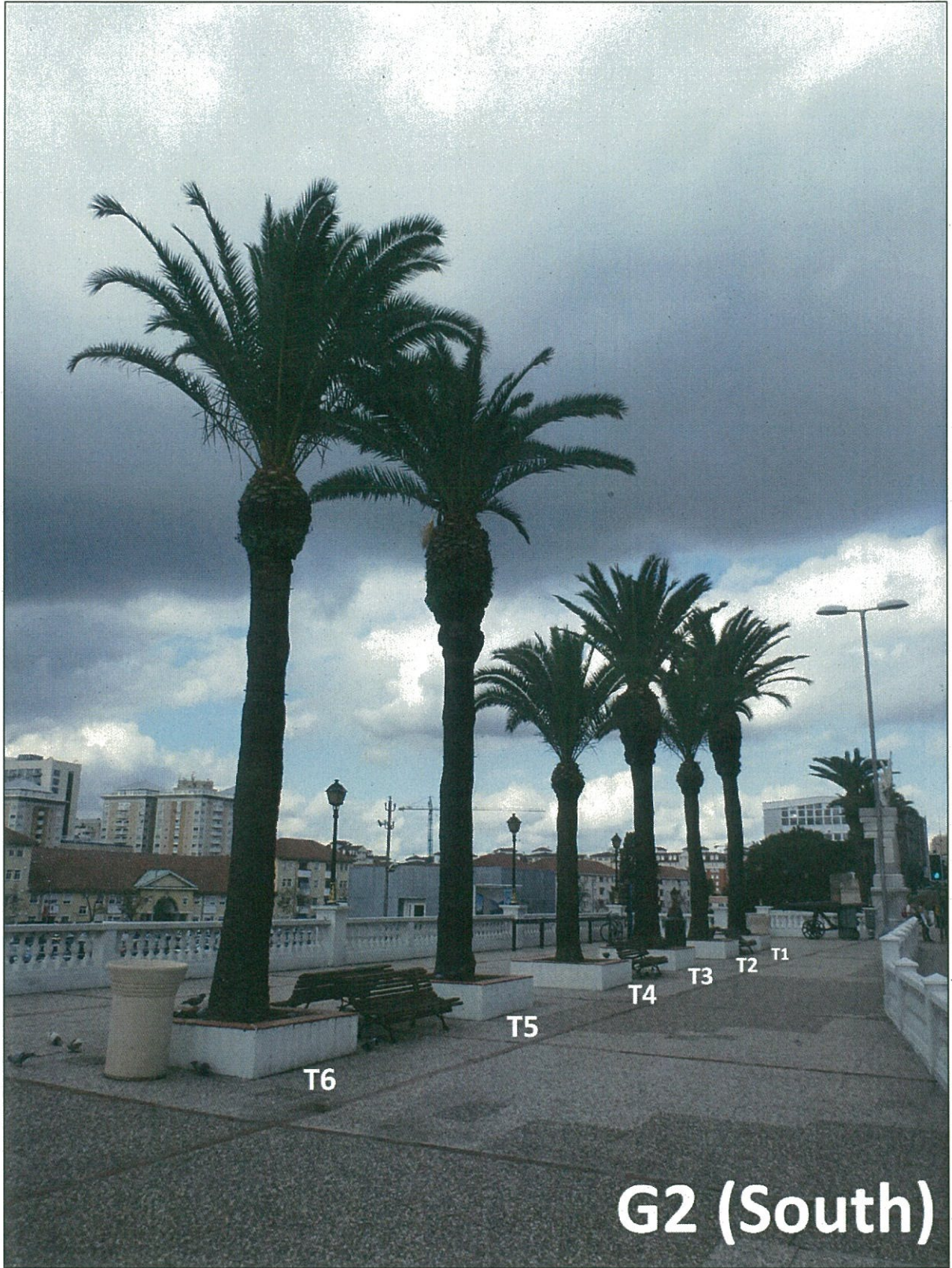
Line Wall Promenade (North), Line Wall Road – G.2