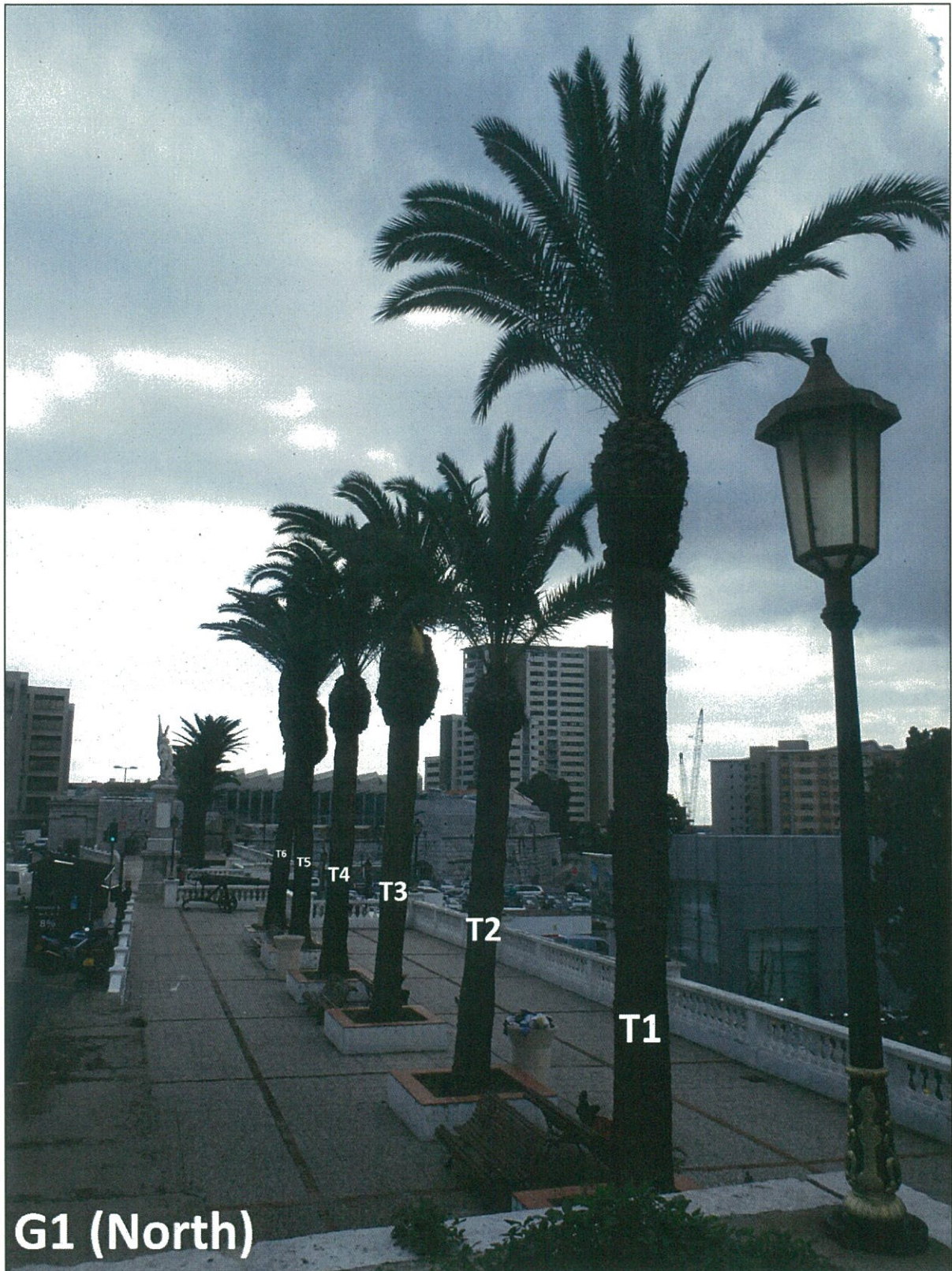
Line Wall Promenade (North), Line Wall Road – G.1