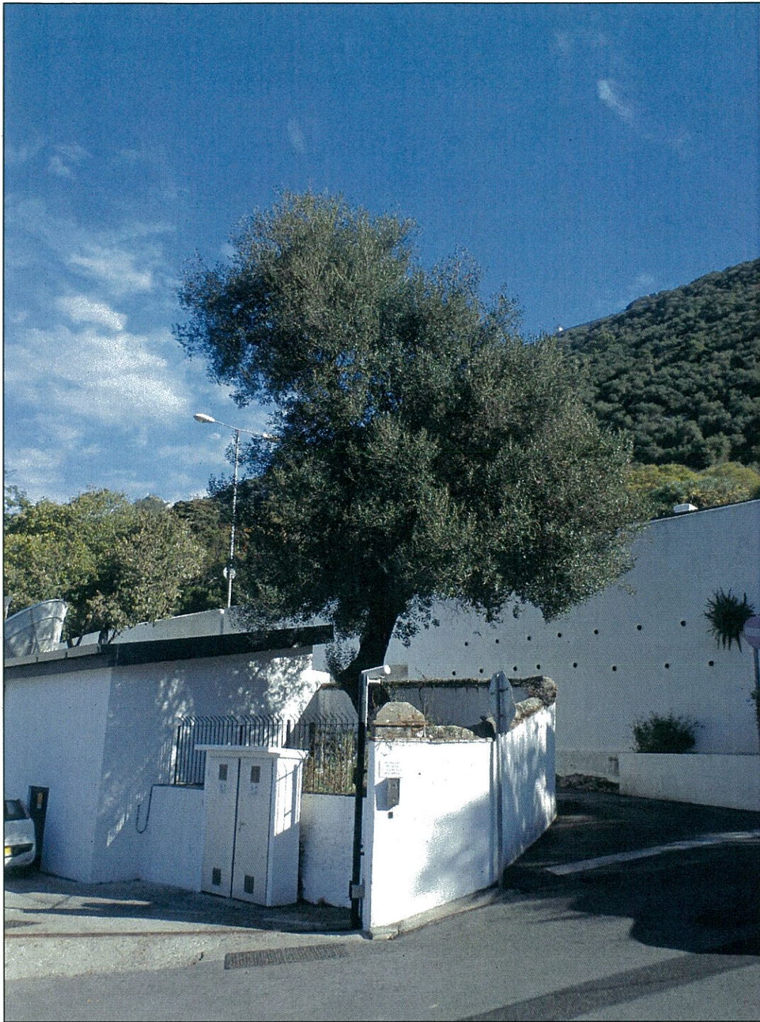
Gibtelecom House (Mount Pleasant), South Barrack Road – T.2