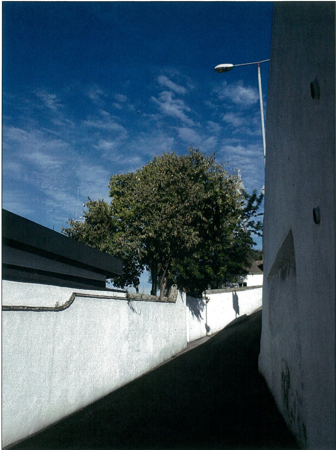
Gibtelecom House (Mount Pleasant), South Barrack Road – T.1