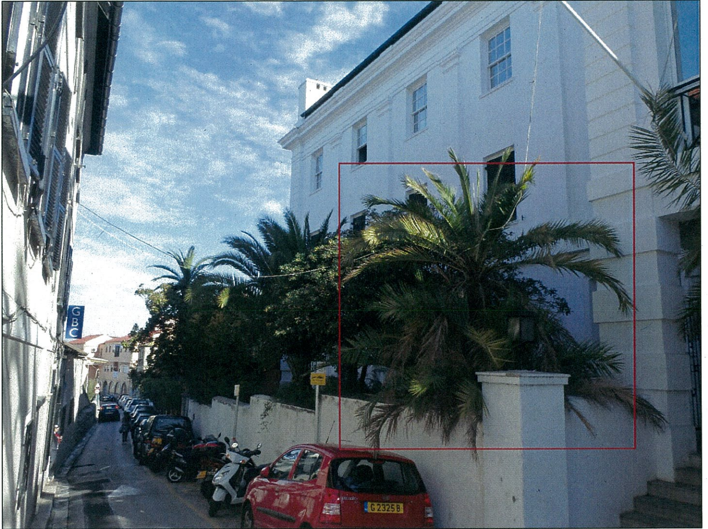
Gibtelecom House (Mount Pleasant), South Barrack Road – T.3