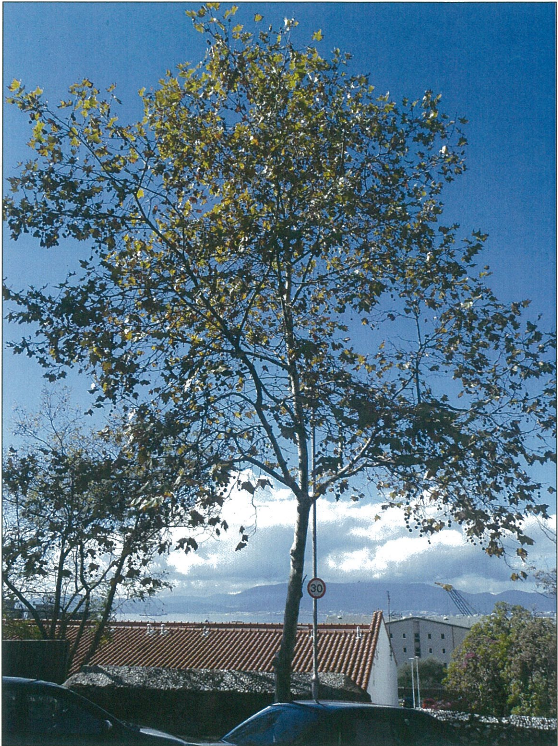
South Barracks Car Park – T.5