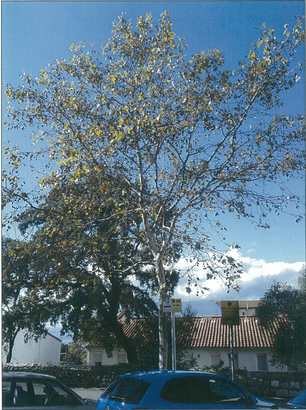
South Barracks Car Park – T.3