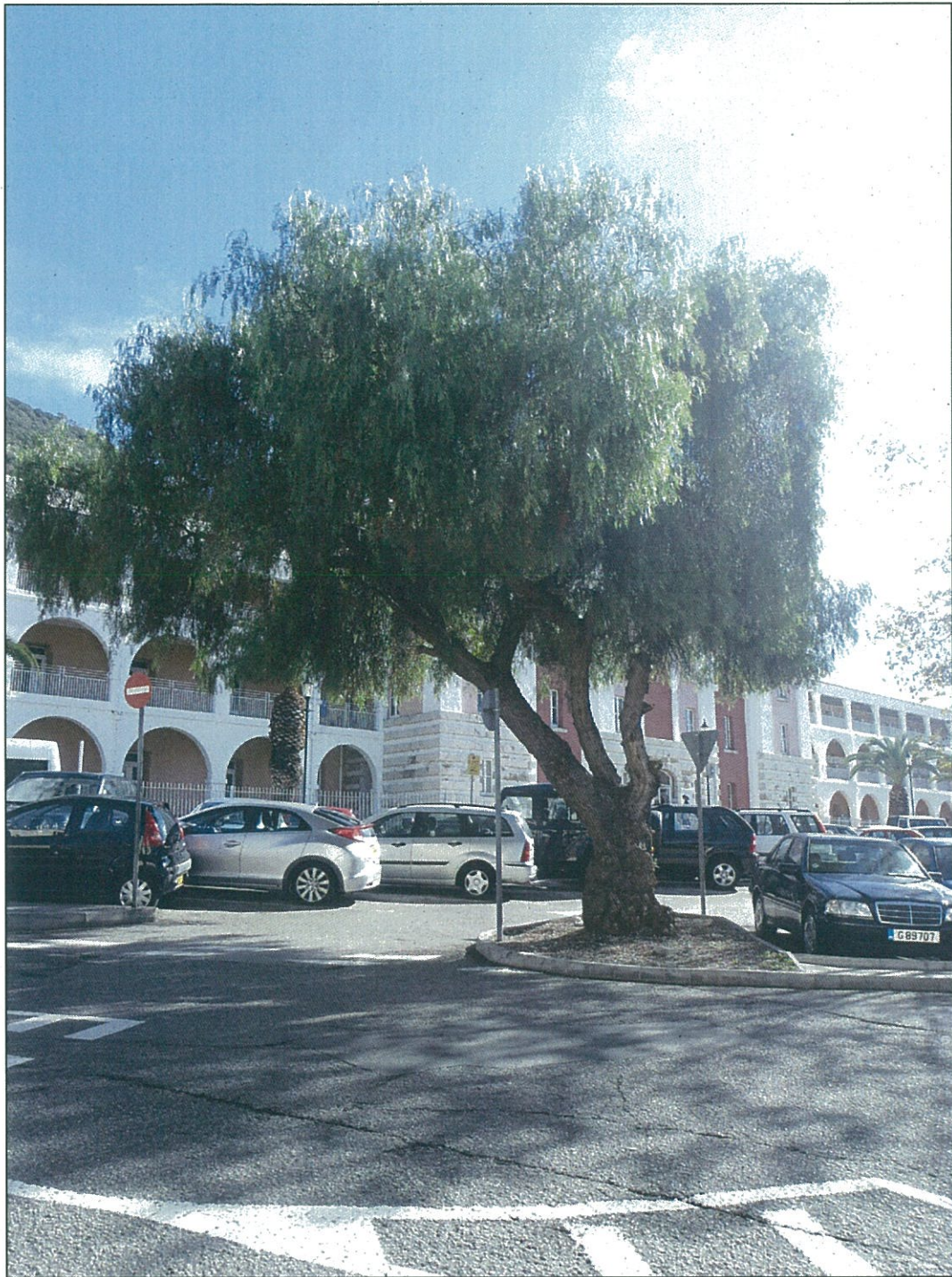
South Barracks Car Park – T.1