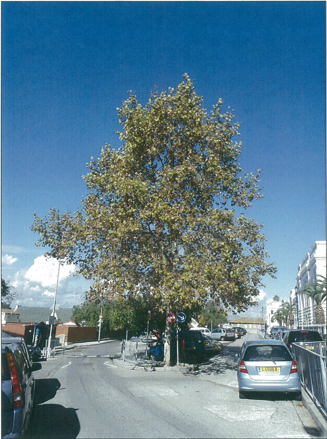
South Barracks Car Park – T.2