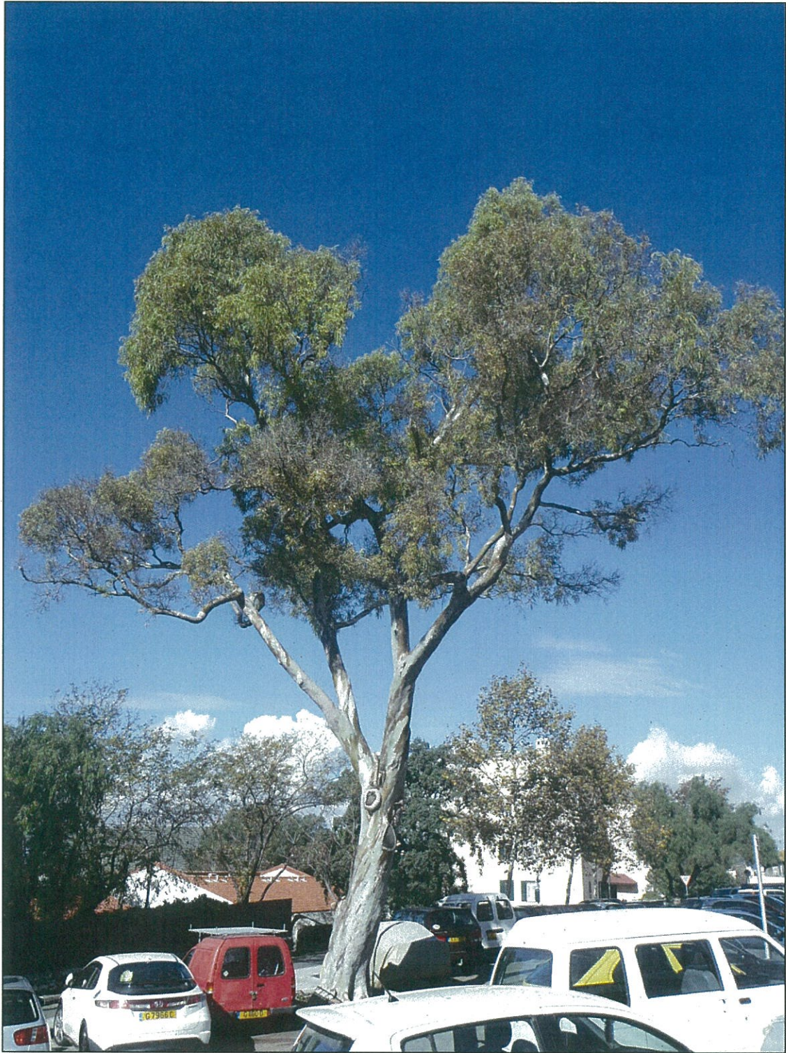
South Barracks Car Park – T.6