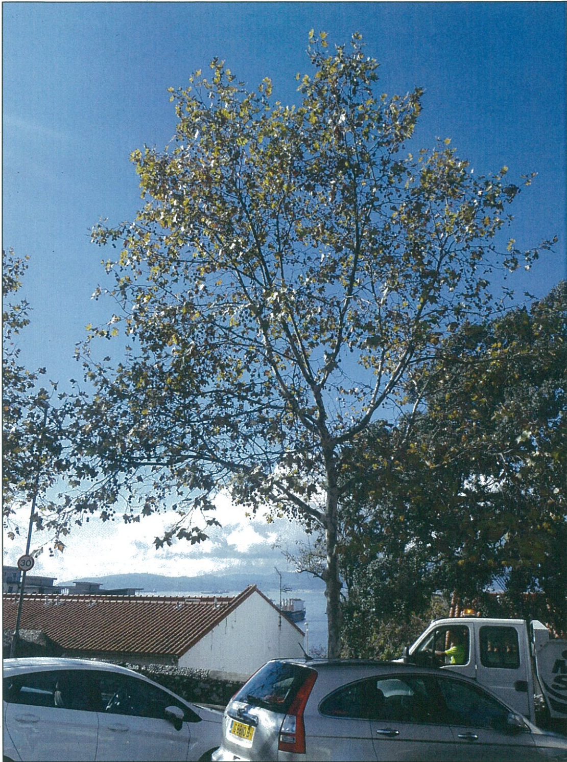
South Barracks Car Park – T.4