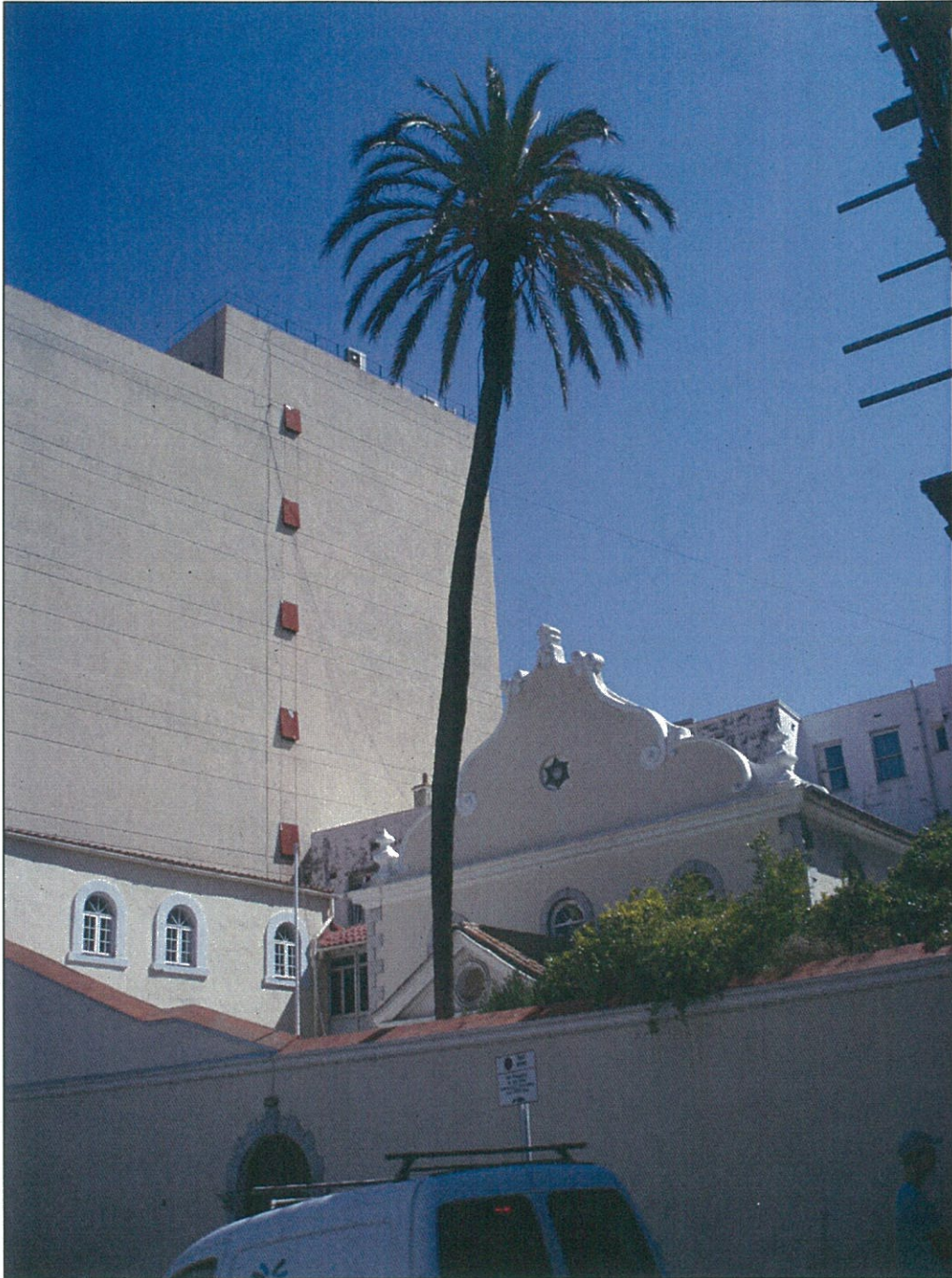
Line Wall Synagogue, Line Wall Road – T.1