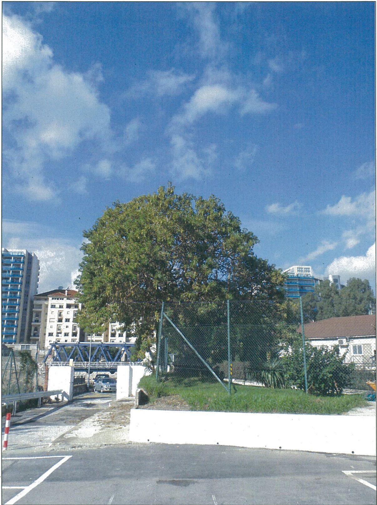
Landport Ditch – T.4