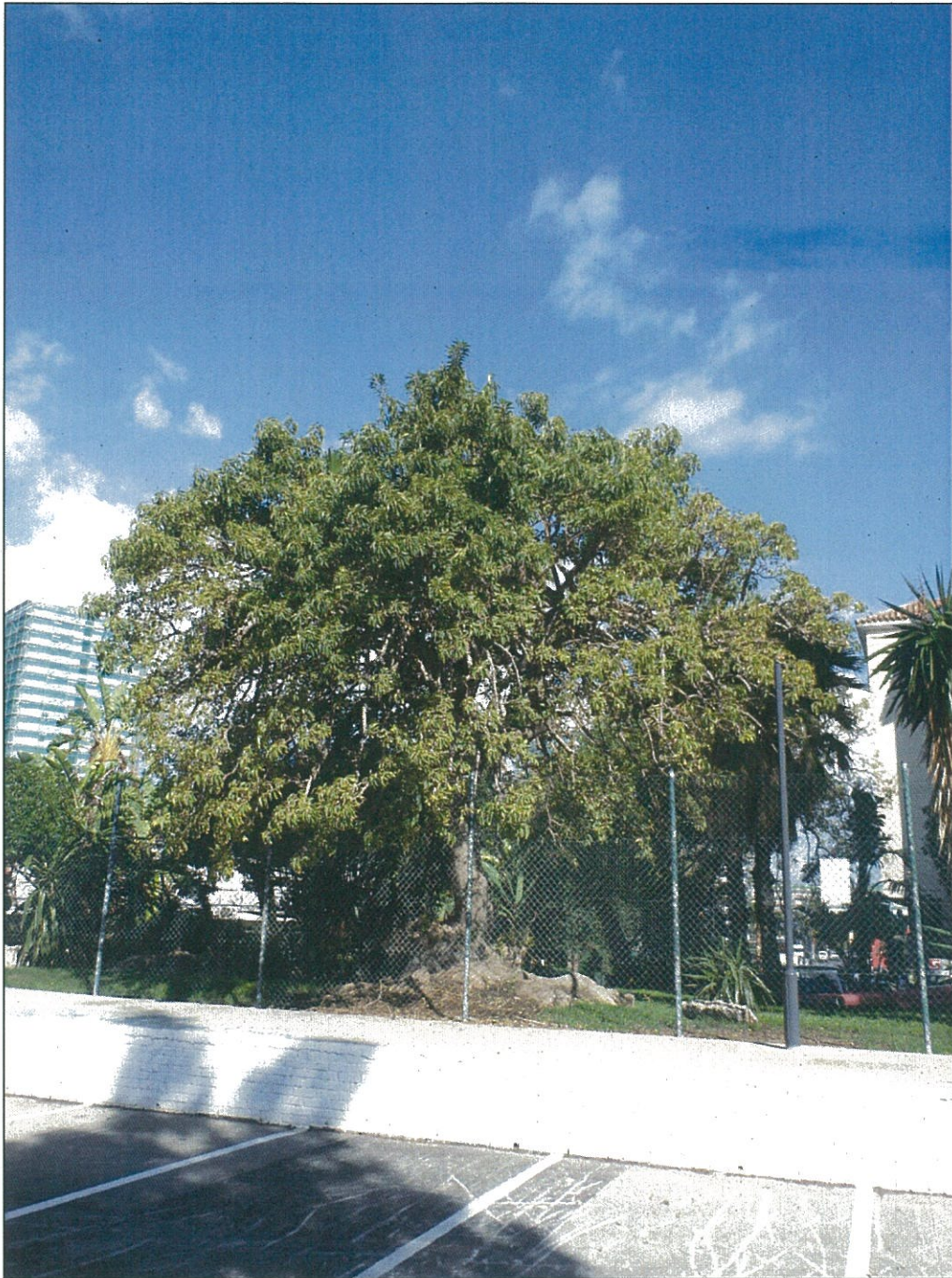
Landport Ditch – T.1