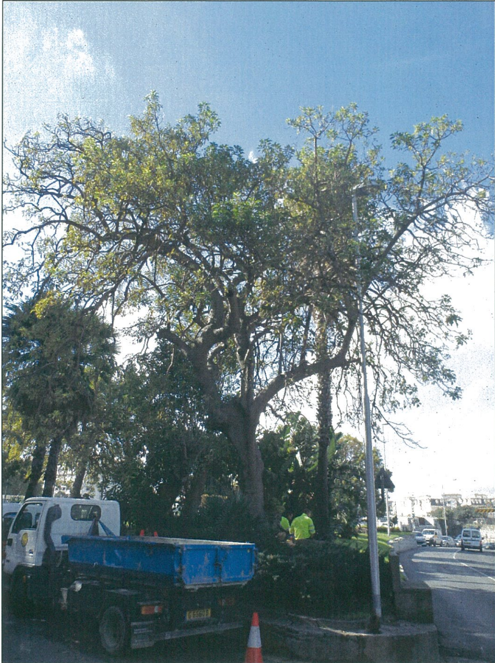
Landport Ditch – T.2