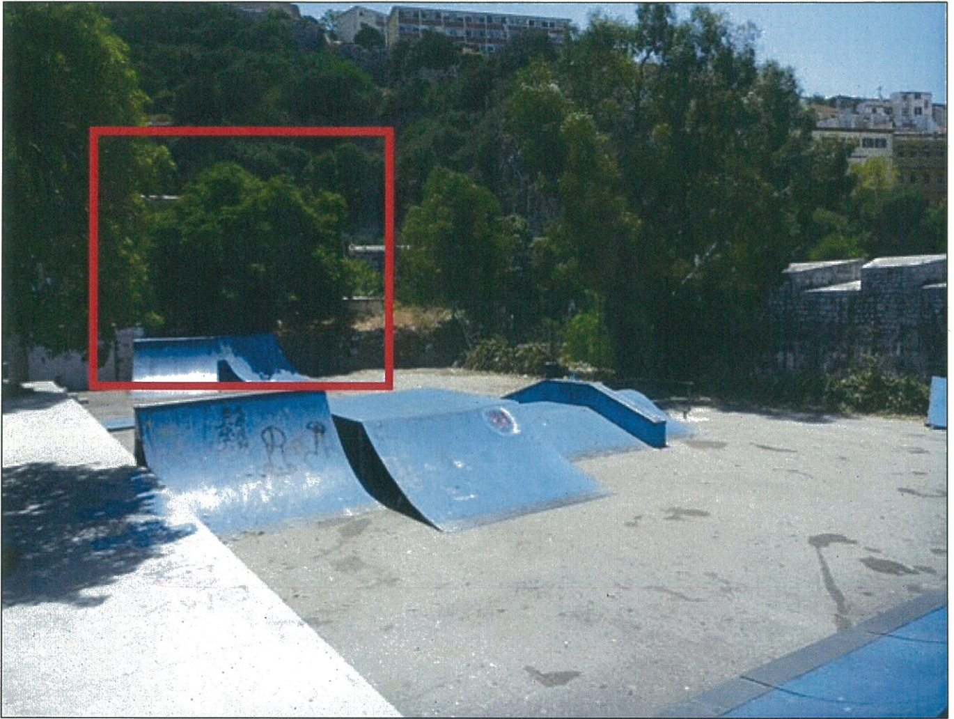
Landport Ditch – T.3