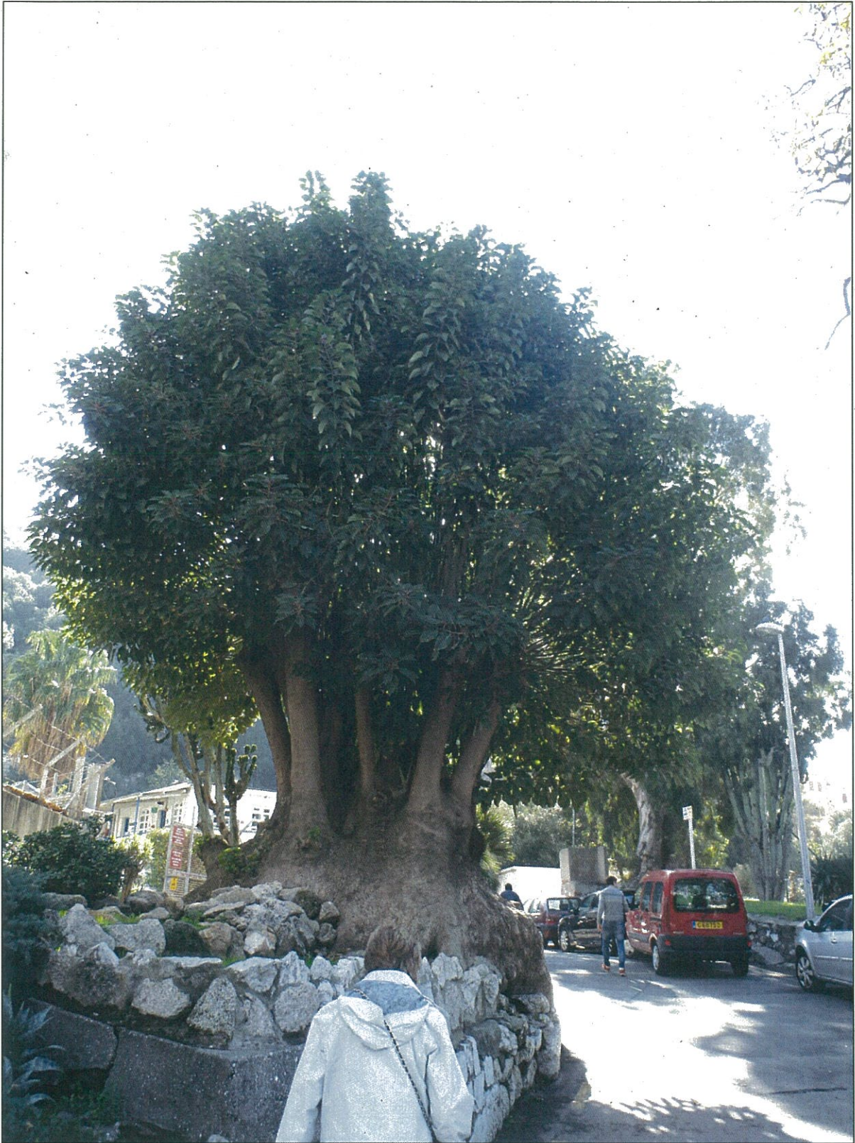
Landport Ditch – T.5