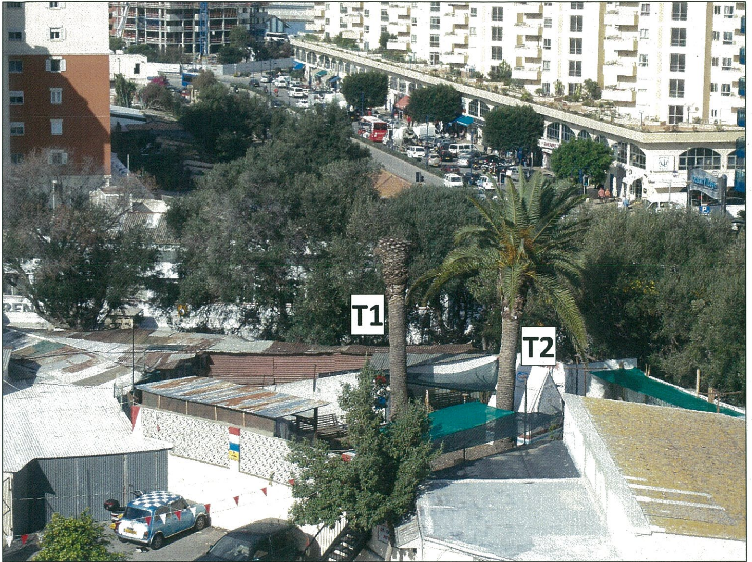
Montagu Bastion (Emile Hostel) – W.1