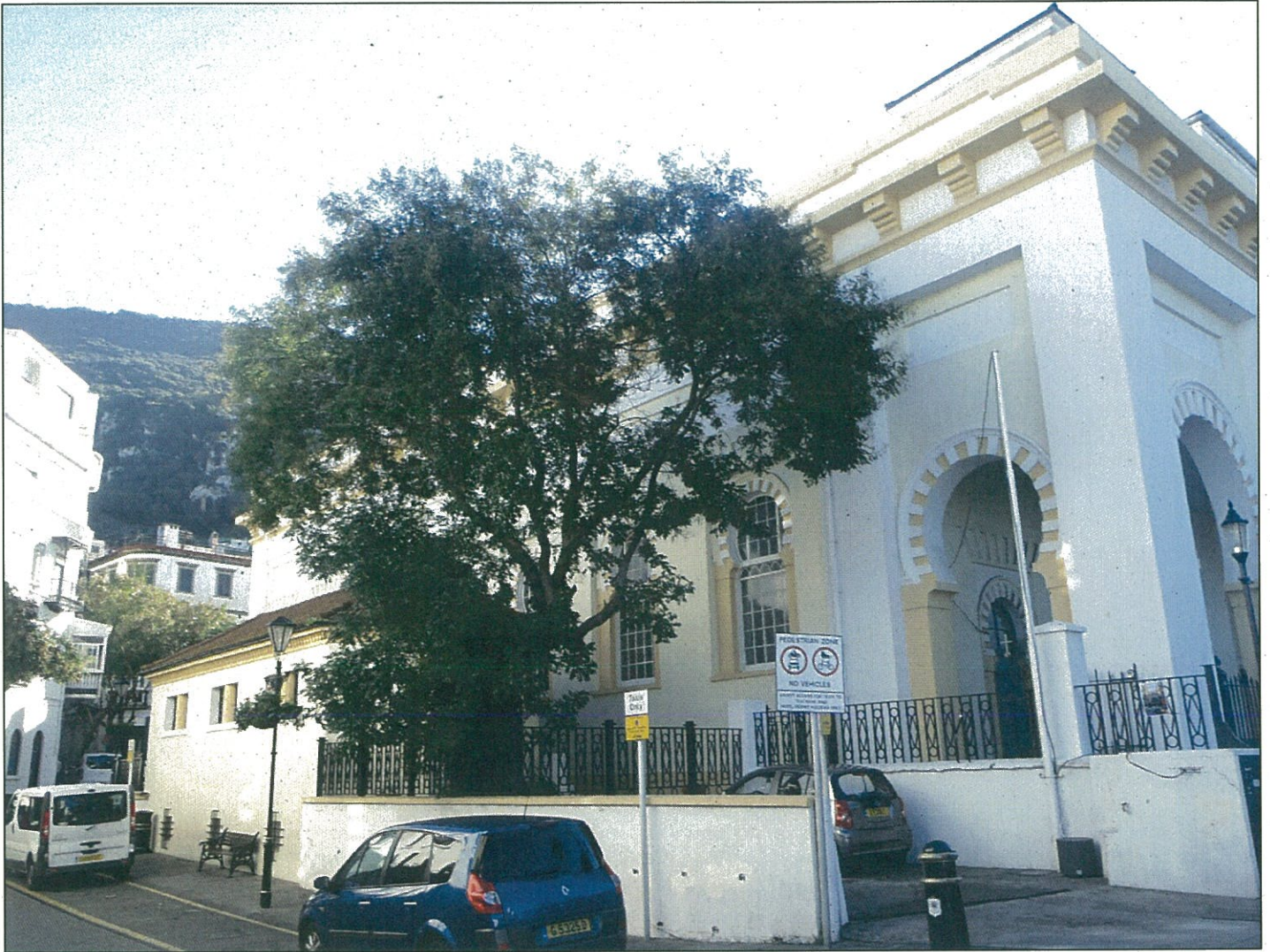
Holy Trinity Cathedral, Cathedral Square – T.1