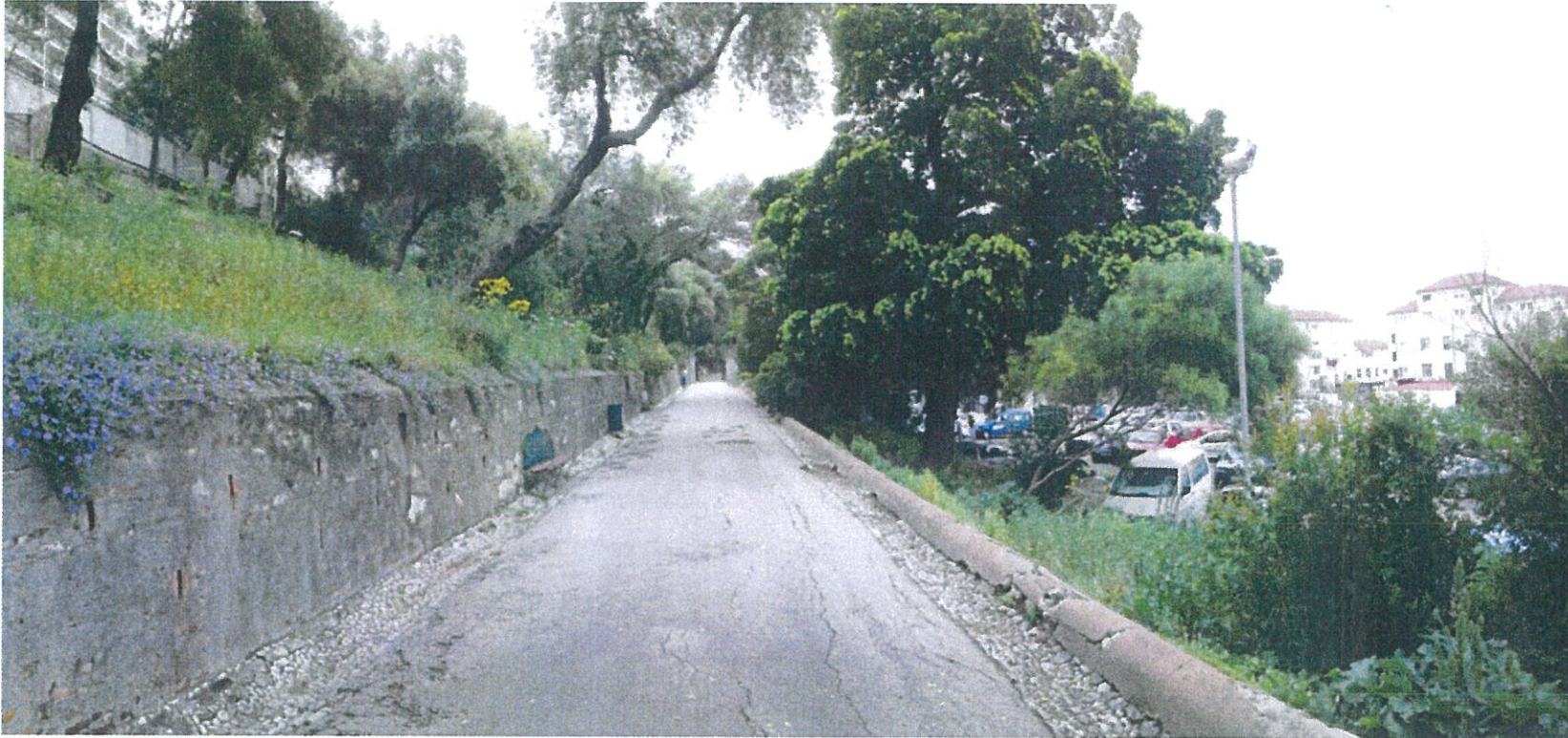
Phase 1 Area