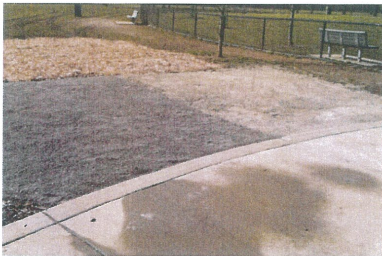
Re-surfacing of path and adjacent area in suitable materials, designation of areas